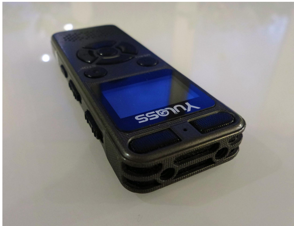
Camera, tripod, audio recording by dictaphone