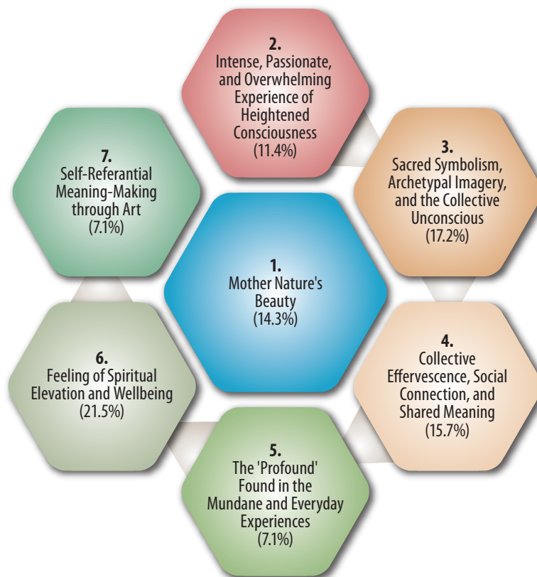
Figure 3. Thematic analysis outcomes for the secondary research question on self-transcendence

The thematic analysis of the inquiry data for the secondary research question— “What is the role of aesthetic experiences in helping individuals achieve a sense of self-transcendence and a deeper connection with something greater than themselves?” – generated 7 themes. These include: a) Mother Nature’s Beauty (14.3%); b) Intense, Passionate, and Overwhelming Experiences of Heightened Consciousness (11.4%); c) Sacred Symbolism, Archetypal Imagery, and the Collective Unconscious (17.2%); d) Collective Effervescence, Social Connection, and Shared Meaning (15.7%); e) The ‘Profound’ Found in the Mundane (7.1%); f) Feelings of Spiritual Elevation and Wellbeing (21.5%); and g) Self-Referential Meaning-Making through Art (7.1%); (see Figure 3). Other codes that did not fall into any category were labelled as Miscellaneous (5.7%).