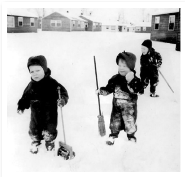
NorWayne neighborhood children, winter of 1947.