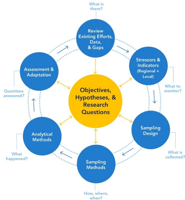
Figure 1: Integrated Monitoring Approach

The integrated approach is based on an iterative process to develop and refine plan components as details are determined. Throughout the process, researchers should be continuously checking the plan components against the objectives, hypotheses, and research questions. This helps ensure plan components complement one another and continue to reflect underlying plan objectives and hypotheses. Linked components also allow self-correction in response to survey implementation, thereby improving project monitoring plan/study design, performance, and efficiency in subsequent years.