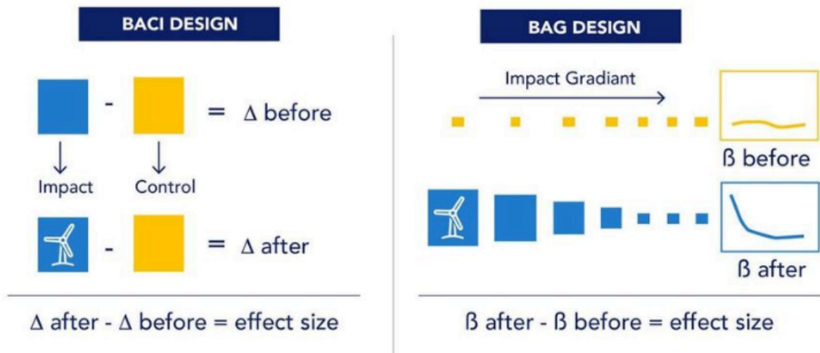
Figure 3: Comparison between a BACI and a BAG sample design

BACI and BAG designs both rely on baseline sampling (top rows) to assess impacts (bottom rows). BACI relies on careful control site selection, relying on the assumption that the wind tower influences along with other environmental forcing such as storms will influence control and impact sites similarly. BAG designs do not require control sites and rely on incorporation of key impact and environmental gradients (Secor 2018)