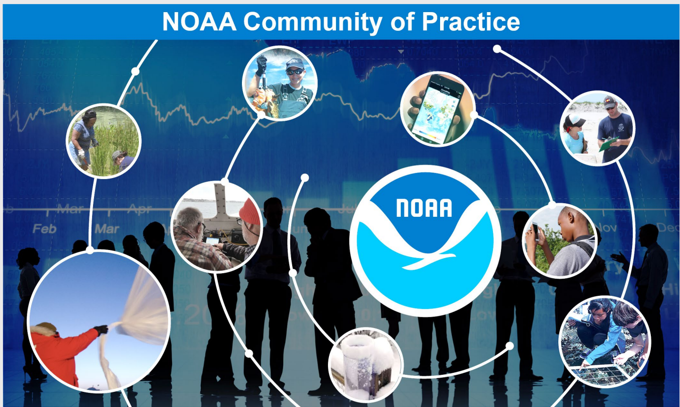
We work collaboratively across NOAA.

The NOAA Citizen Science Community of Practice connects and supports citizen science work across the agency. It was launched by the Office of Education in 2013. Its formation and structure were informed by the NOAA Education Council and NOAA citizen science project leads. The community relies on voluntary grassroots participation and works to compile best practices, share resources, and maintain a searchable database of projects. It is open to anyone within NOAA working to, or interested in, engaging the public in the scientific process through citizen science. In April of 2020, the Community of Practice organized and participated in the first NOAA Citizen Science Workshop. As of 2022, the Community of Practice had over 225 members and primarily communicates via an email listserv.