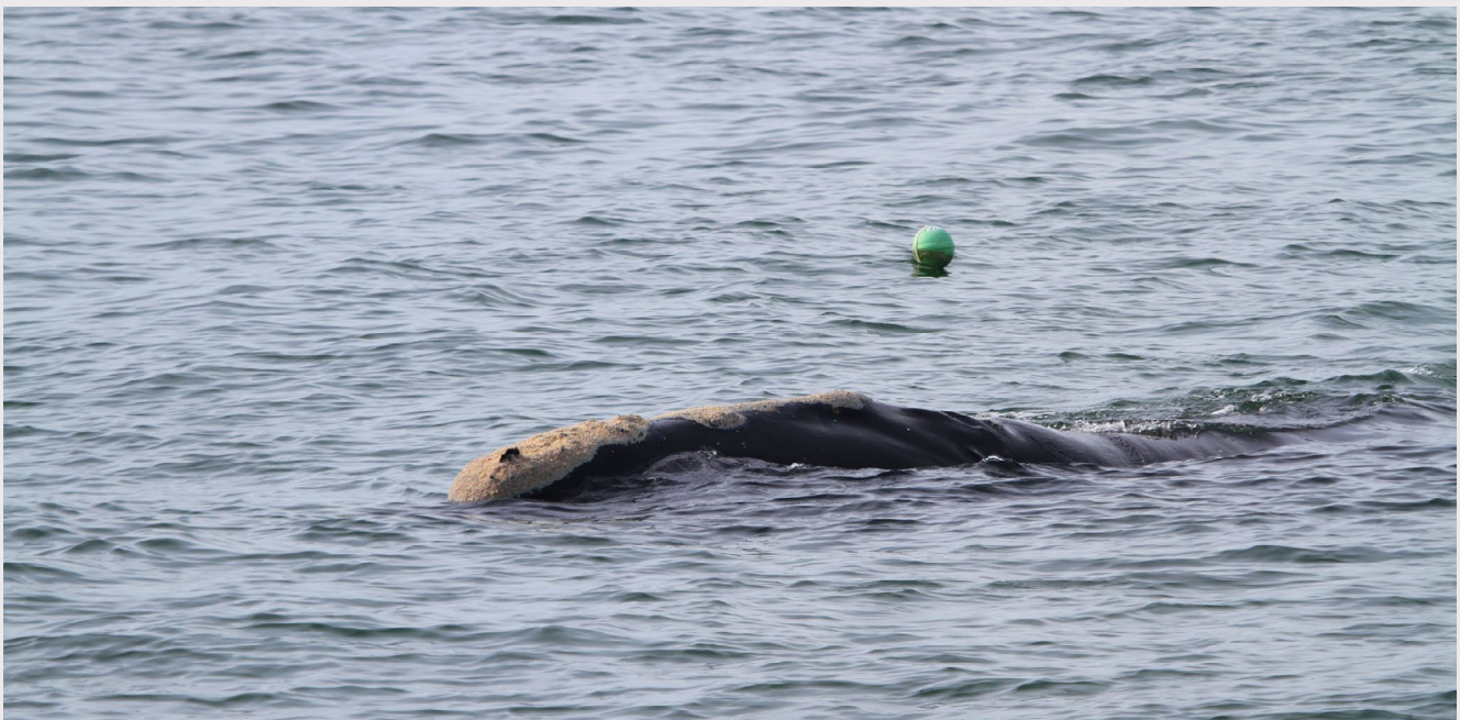
North Atlantic right whale swims next to blue crab fishing gear marked with a green buoy. Credit: Florida Fish and Wildlife Conservation Commission, NOAA Research Permit #15488

Using novel solutions to address our challenges will offer NOAA Fisheries the opportunity to solve tough, mission-critical problems by engaging innovative collaborations to achieve a common goal. One such project aims to identify technology options to track the location of ropeless/buoyless fishing gear. There is a great need for ropeless/buoyless fishing gear to reduce the amount of vertical lines in the water column, which pose serious and lethal threats to marine mammals and sea turtles. The threat of entanglement from vertical fishing lines is particularly severe for North Atlantic right whales and leatherback sea turtles, which are endangered species. Tracking technology on ropeless/buoyless fishing gear would allow fishers to relocate their gear without the need for a surface buoy and its associated lines. A collaborative team of NOAA scientists and Yet2, an innovative technology scouting firm, worked to identify robust technology options to track ropeless/buoyless fishing gear deployments. This capability will allow gear locations to be shared with fishermen, as well as enforcement agencies and nearby vessels. This new technology initiative is an important contribution toward NOAA Fisheries' mission in the stewardship of living marine resources, because it would mitigate one of the primary threats to endangered whales and sea turtles, entanglement in fishing gear.