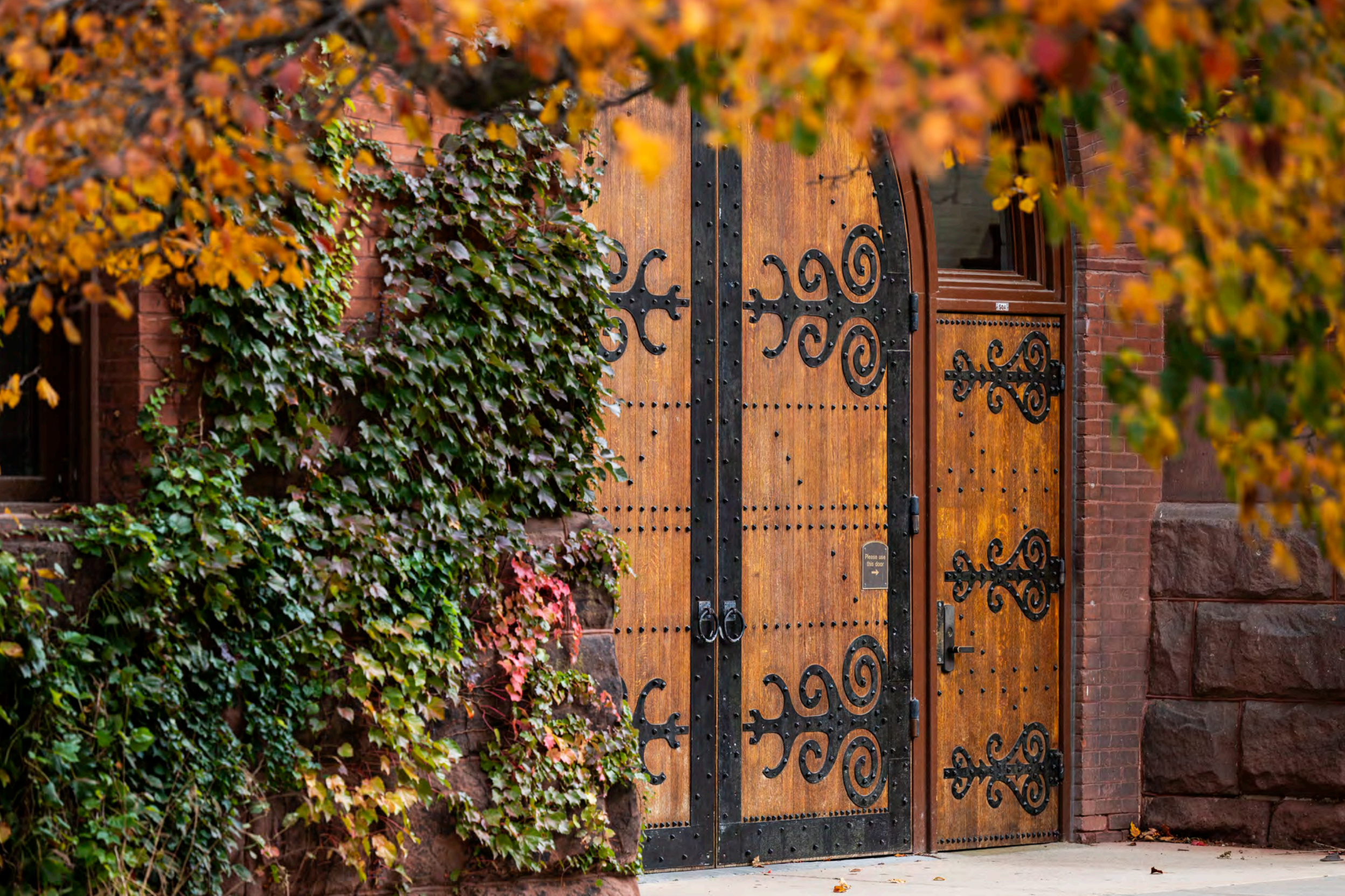
Tree leaves frame a view of the main doors to the Red Gym (Armory and Gymnasium) during a late autumn day. Originally constructed as the university's second gymnasium, today it is home to the Gender and Sexuality Campus Center, the Morgridge Center for Public Service, the Multicultural Student Center, student identity centers, and other places where students gather and connect.