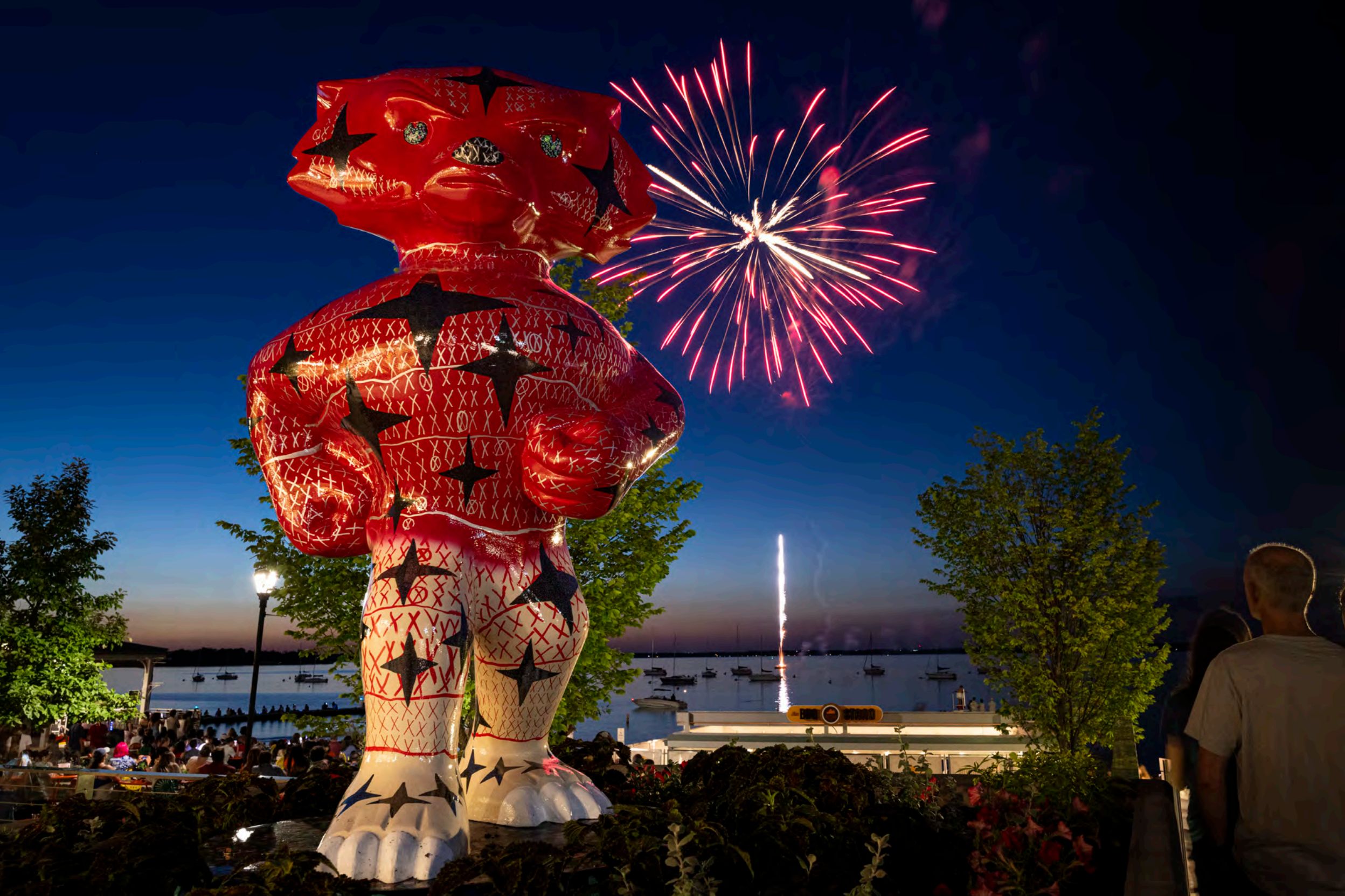
Members of the UW–Madison community enjoy a summer night on the Terrace as a fireworks show takes place on Lake Mendota.