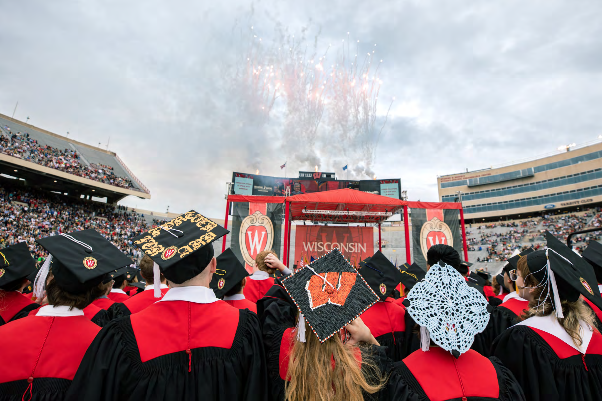
Graduates watch a fireworks display that marks a celebratory end to the UW-Madison's spring commencement ceremony at Camp Randall Stadium. The outdoor graduation is attended by thousands of students and their guests each year.