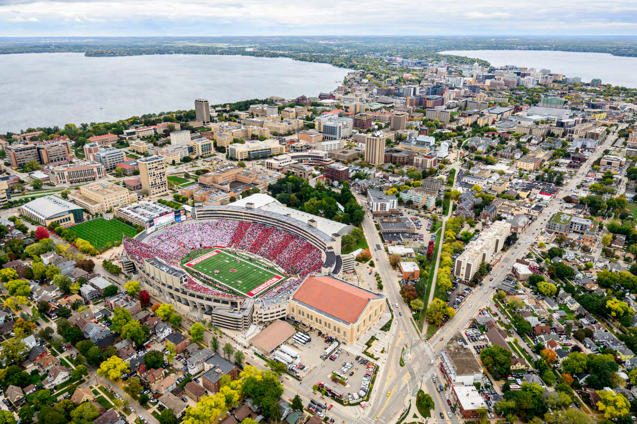
A sea of red- and white-attired fans fill Camp Randall Stadium. The aerial photograph was made from a helicopter looking northeast toward the isthmus and Wisconsin State Capitol with Lake Mendota on the left and Lake Monona on the right.