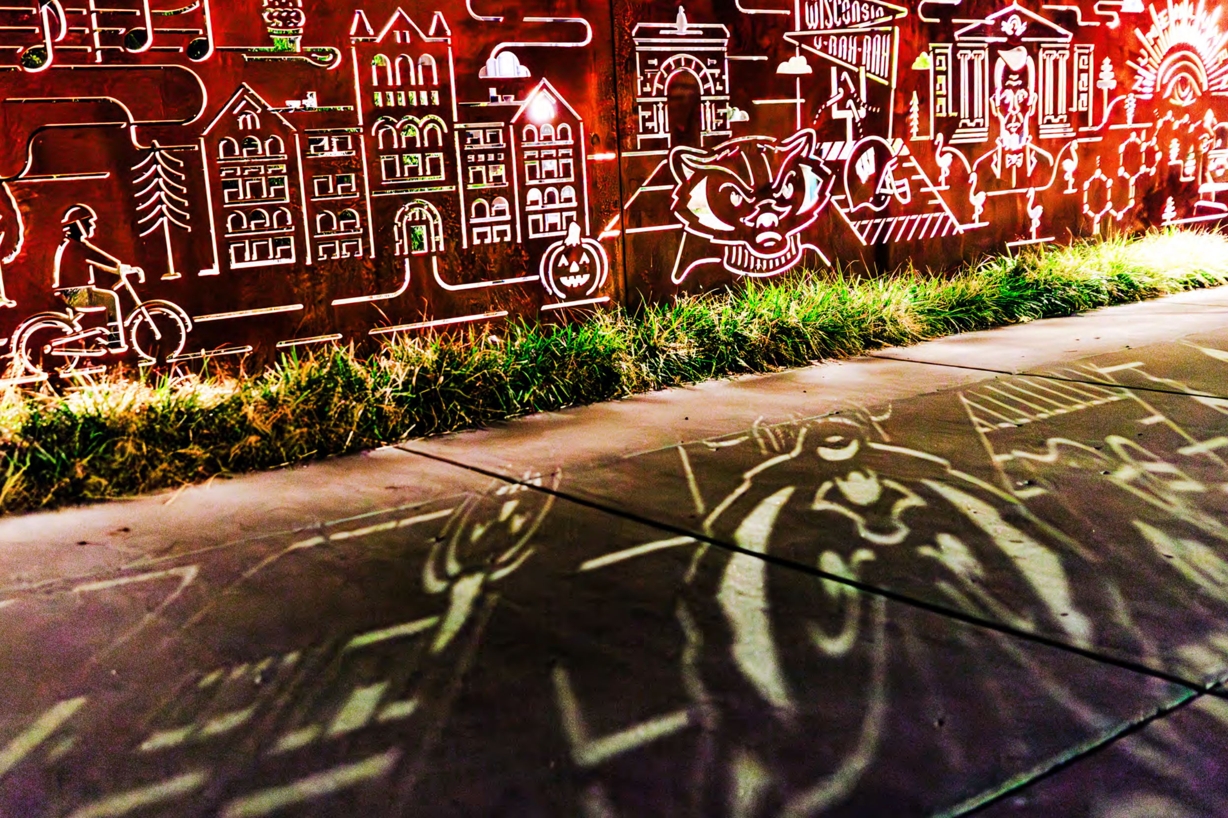
A shadow of Bucky Badger shines onto the sidewalk in Alumni Park, which features artful exhibits, scenic green spaces, and alumni stories. Backlit in the background are iconic, cutout graphics in rusted steel of the park's 80-foot Badger Pride Wall.