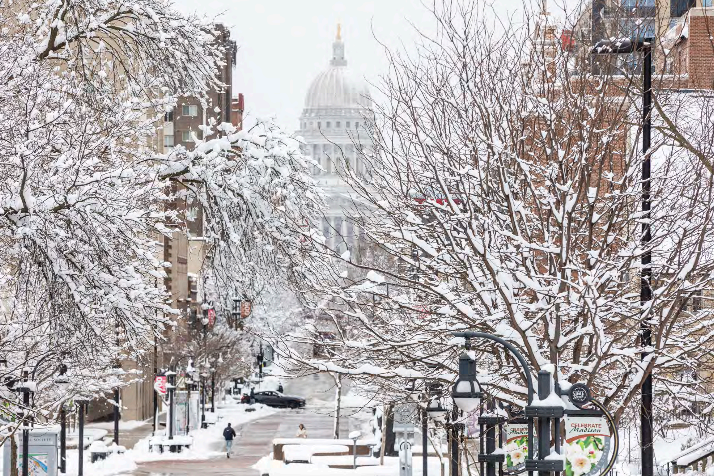
Pedestrians and commuters move through Library Mall and State Street with the dome of the Wisconsin State Capitol in the background.