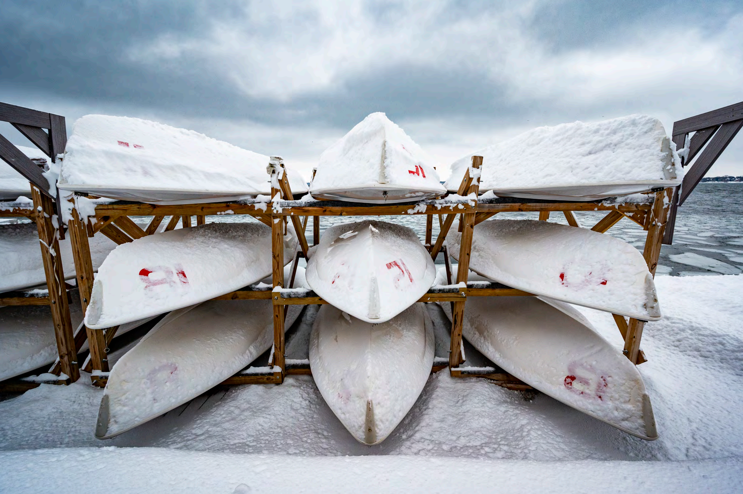
Boats stored for winter along the Memorial Union lakeshore are covered in snow following an overnight snowstorm.