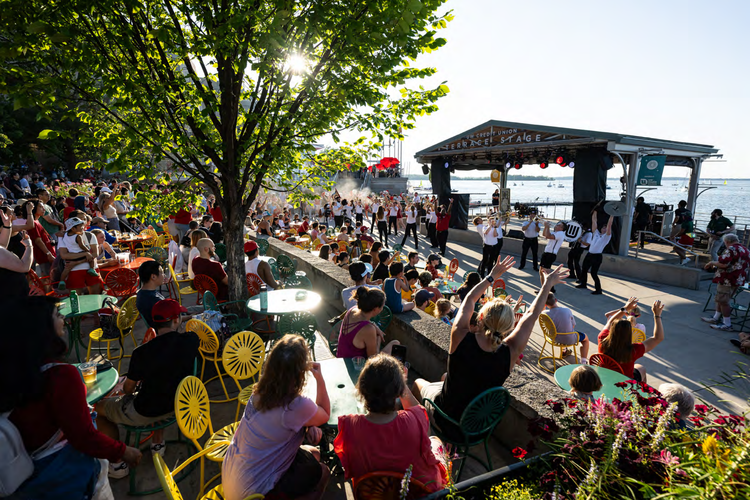
Community members dance along with the UW Spirit Squad, UW mascot Bucky Badger, and members of the UW Marching Band during UW-Madison's 175th Anniversary Launch Day Celebration at the Memorial Union Terrace.