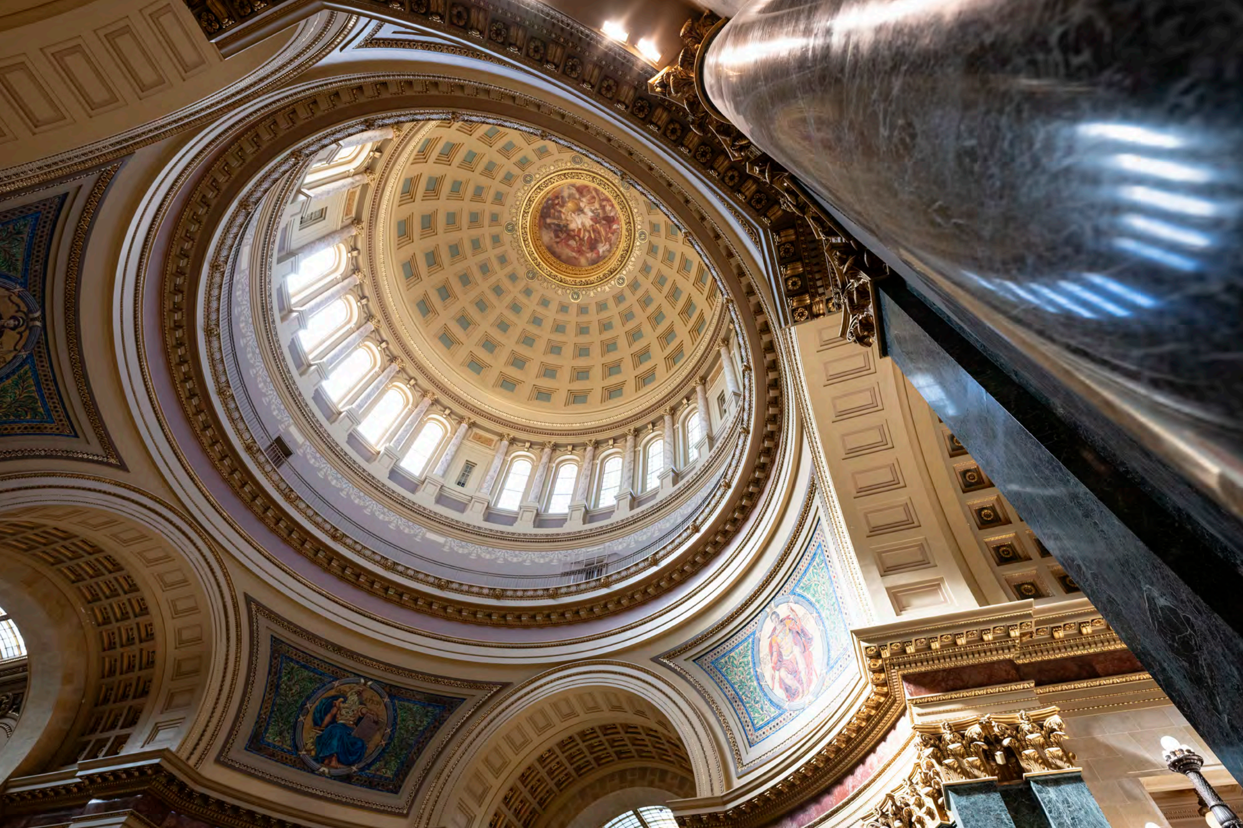
The interior dome of the Wisconsin State Capitol is pictured during Research in the Rotunda in the Capitol. The outreach event provides students and faculty advisors from across the Universities of Wisconsin with the opportunity to share their research findings with Wisconsin legislators, state leaders, UW alumni and members of the public.