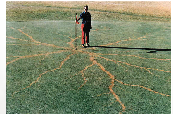
Lightning discharge on a golf green.

For more information, visit www.weather.gov/lightning