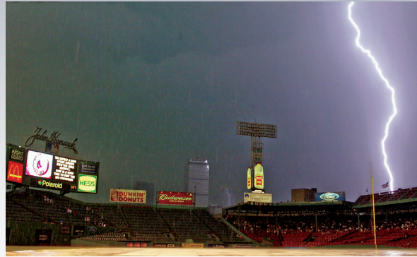
Stadiums and other outdoor venues should have a lightning safety plan.

Finally, some victims were struck inside homes or buildings while they were using electrical equipment or corded phones. Others were in contact with plumbing, outside doors, or window frames. Avoid contact with these electrical conductors when a thunderstorm is nearby!