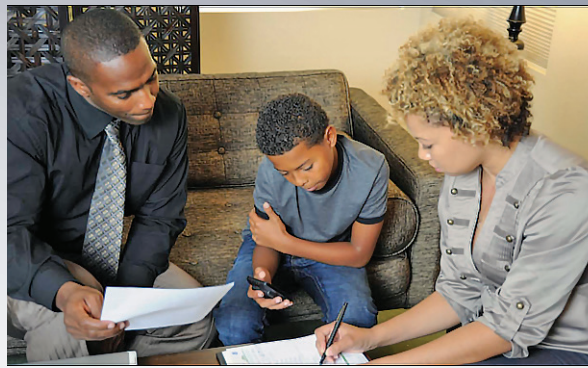
Sit down with your family or friends and develop a communications plan.