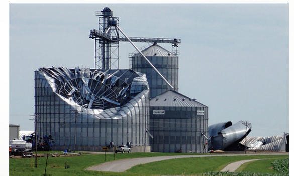
After a tornado, watch out for dangerous debris, such as sharp metal, glass, or downed power lines.