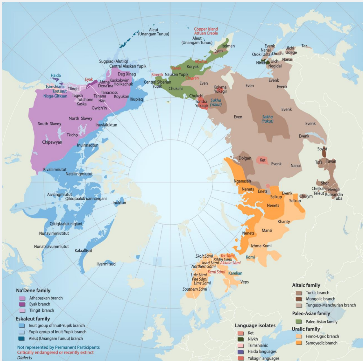
Figure 1. Map of Arctic Indigenous languages spoken by members of the Arctic Council Permanent Participant organizations. The borders between the language families and locations are illustrative and not entirely precise. Most languages are written in English and not in their traditional orthographies. Different dialects are marked in italics to demonstrate diversity within languages.