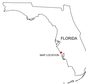
Tsunami Sources Modeled for the Don Pedro Island-Boca Grande coastline