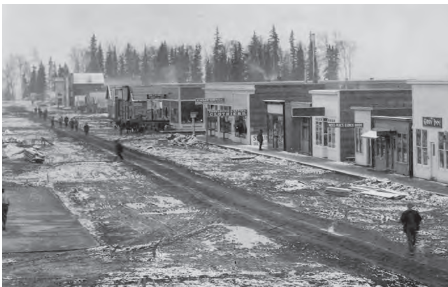
Anchorage townsite, October 1915.