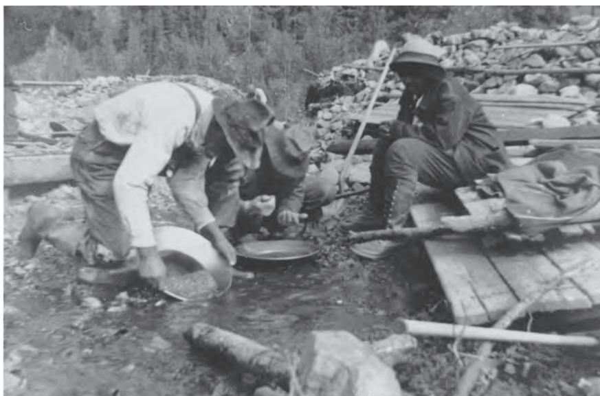
Black miners working a claim on Dominion Creek, c. 1890s.