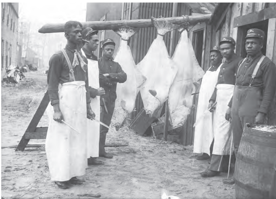
Six African American soldiers with three halibut, 1896–1913. William Norton Photo Collection, Alaska State Library (P226-867).