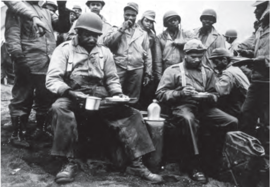
This photo of black troops was taken on May 20, 1943, nine days after the invasion of Attu Island on Massacre Bay, Attu, Aleutian Islands.

Aleutians and recalled those who ended up in the Aleutians typically fell into one of three categories: “troublemakers, homosexuals, and P.A.F.s.” P.A.F. stood for Premature Anti-Fascists, a moniker given to outspoken leftists who were sympathetic to the Russian Revolution, civil rights, and organized labor and supported the Republican faction in the Spanish Civil War that raged through the late 1930s. Not surprisingly, a relatively large contingent of black troops ended up in this theater of war as well.