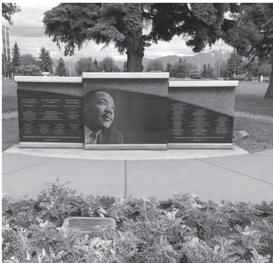
The Martin Luther King Jr. Memorial, downtown Anchorage, 2018.