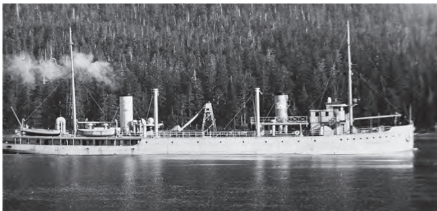
Michael Healy's USS Revenue Cutter Bear, c. 1900s.

After the Treaty of Cession, the U.S. Revenue Cutter Service—the forerunner to the U.S. Coast Guard—patrolled Alaska waters and maintained a presence along the coast; it was among the first federal institutions to do so. No captain assumed as large a role in the region as did Michael Healy, a man of mixed African and Irish descent. After the Civil War, Healy developed a reputation as a skilled navigator and as a man who demanded much from his crew. Born in Georgia in 1839, Healy was the son of an Irish-born slaveholder and a