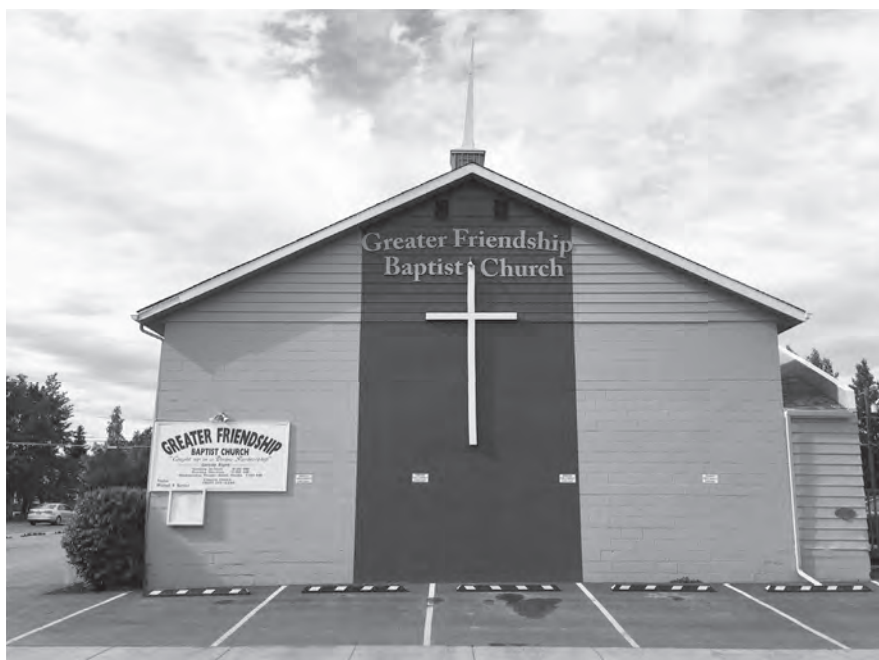
Greater Friendship Baptist Church, a longtime site of worship and activism in Anchorage's black community.

In 1951 black men and women gathered in the basement of the First Baptist Church. Once the congregation grew, they separated and met at nearby Pioneer Hall. Soon after, the men and women raised money and constructed their present house of worship, calling it the Greater Friendship Baptist Church. They composed Alaska's first black congregation. But more