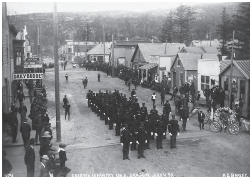
Company L, Twenty-Fourth Infantry, Skagway, July 4, 1899.