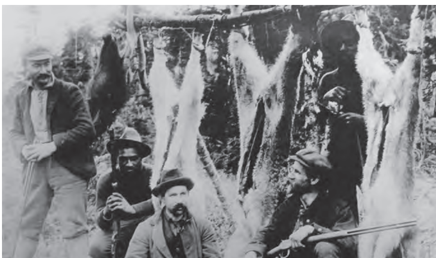
Members of Company L, Twenty-Fourth Infantry join locals at Warm Pass, just outside of Skagway, after a successful hunt, 1901.