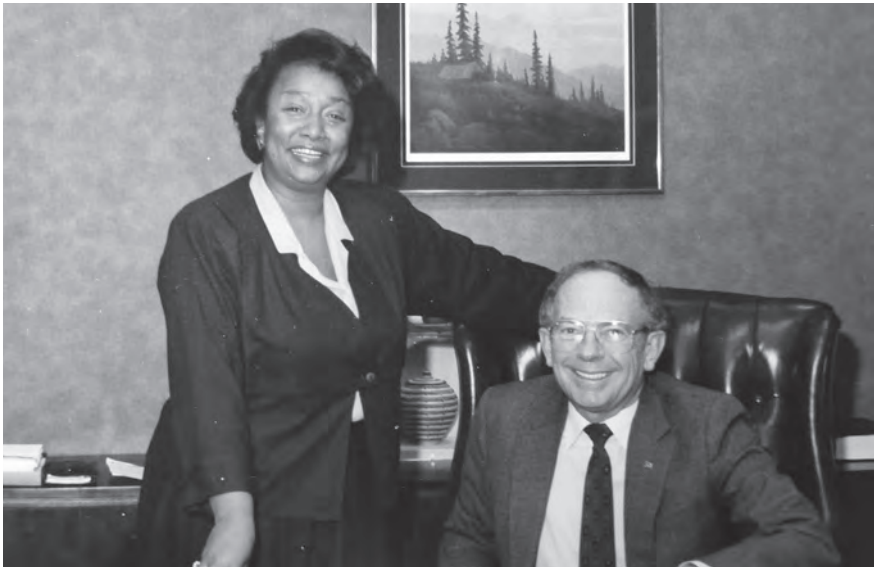
Eleanor Andrews with Governor Bill Sheffield, 1986.

As an alternative, Smith suggested that the Fairview community center would be a more appropriate facility to name after King. After all, Smith reasoned, African Americans had long lived in or around that eastside neighborhood; thus, it was more proper to place the iconic civil rights leader's name on a local landmark in the black community rather than one with such high visibility within the city as a whole. For Smith and his supporters, Martin Luther King Jr. and, by extension, his accomplishments simply did not warrant city or statewide recognition. The Anchorage Daily News reported the controversy over what to name the arts center throughout the latter half of 1986 through 1987. In October 1987, city residents went to polls on the day of the referendum and voted by a 3 to 1 margin to affirm the petition and reject naming the facility after King. The acrimony reached its peak when during the debate, one assembly member claimed to have “heard the word ‘nigger’ more times in the past three weeks than in the past 25 years.”