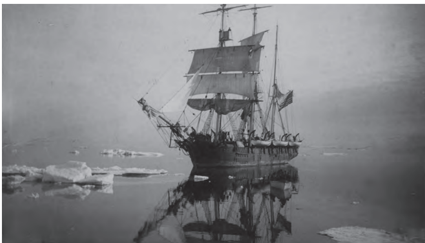
Whaling in icy waters, c. 1880s.