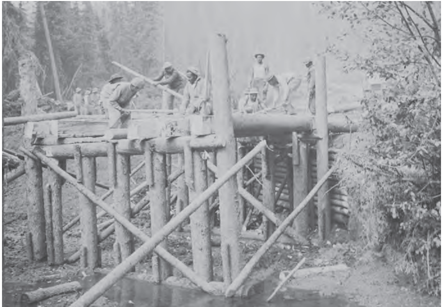
Soldiers of the African American Ninety-Fifth General Services Regiment at the Sikanni Chief River Bridge, British Columbia, 1942.