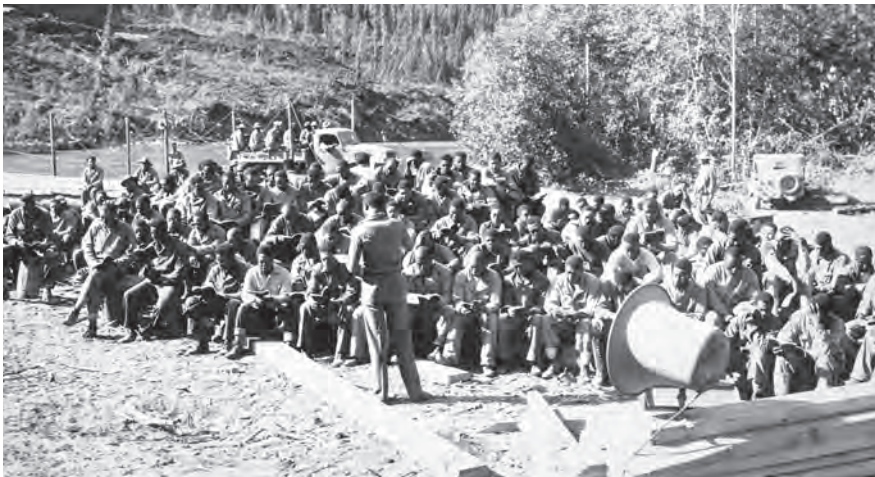
Black troops hold a roadside church service, 1942.