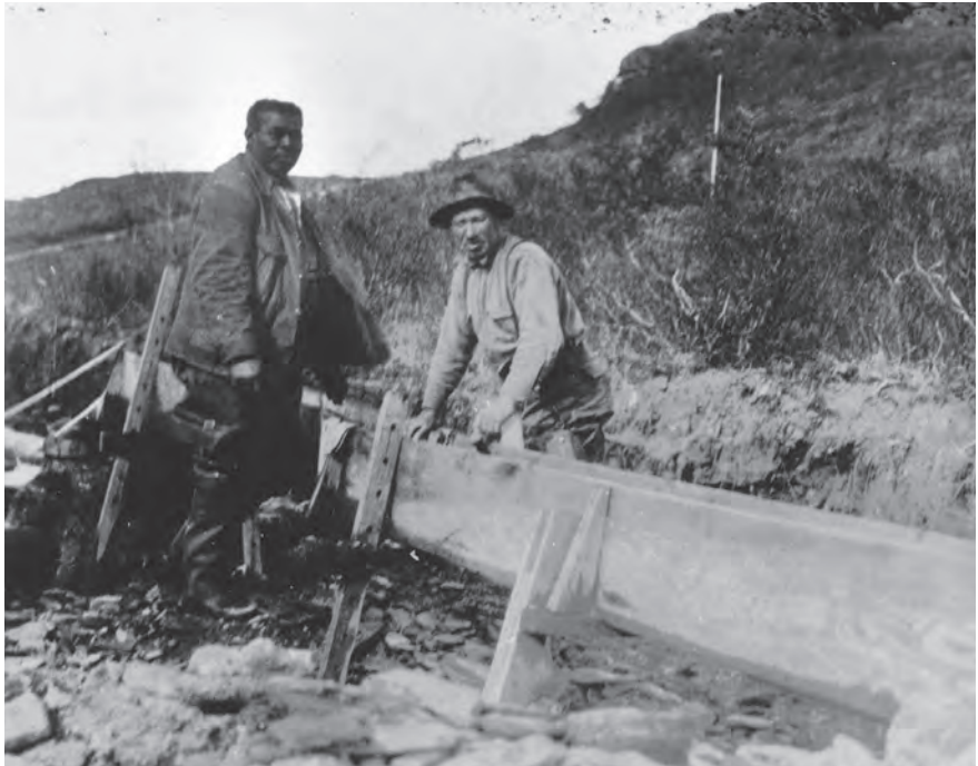
Black gold rushers, c. 1900s.