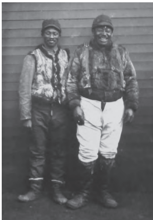
Black whalers posing for a photo at Point Barrow, c. 1900s.

Before the Civil War, at least several African Americans arrived in Alaska and its waters, well before the United States purchased the territory from Russia, and a century before it entered the union as the forty-ninth state. Though Alaska was certainly not a stop on the Underground Railroad, whaling in the Pacific provided an untold number of men—certainly in the hundreds and possibly the thousands—one avenue to find work after escaping bondage in the American South. Other free blacks sought employment in the whaling industry due to its reputation for less discrimination than most land-based industries. And yet others may have been impressed into service on whaling ships under the fear or threat they would be caught and returned to the South. A life at sea, while harsh, nonetheless ensured refuge from the slave catchers who increasingly roamed the nation's northern cities and towns by the 1850s. This presented the most enticing reason to sign up aboard a whaling ship.