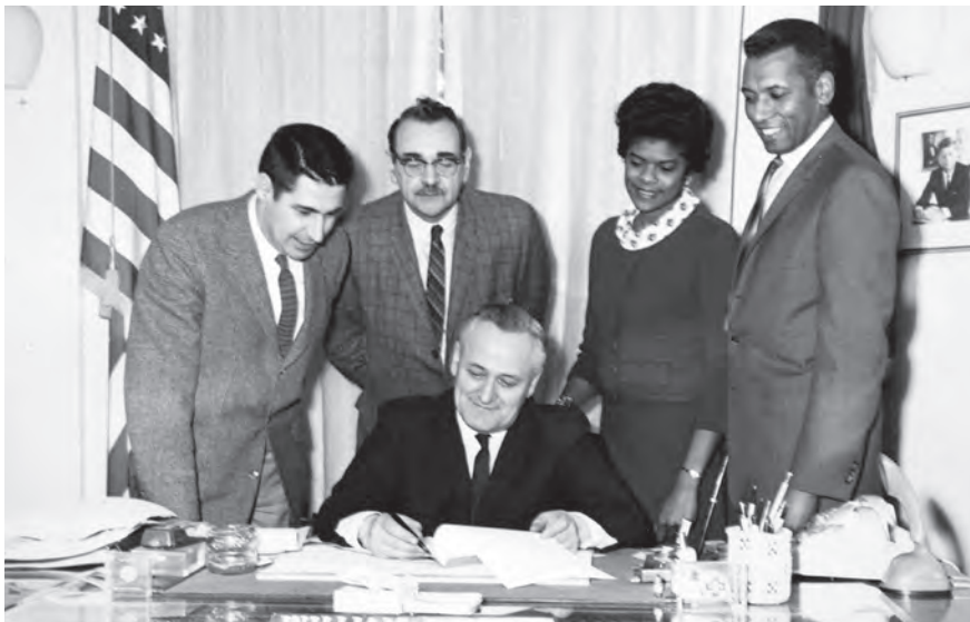
Governor William Egan signs the Human Rights Act with Willard Bowman and Maria Bowman, top right.