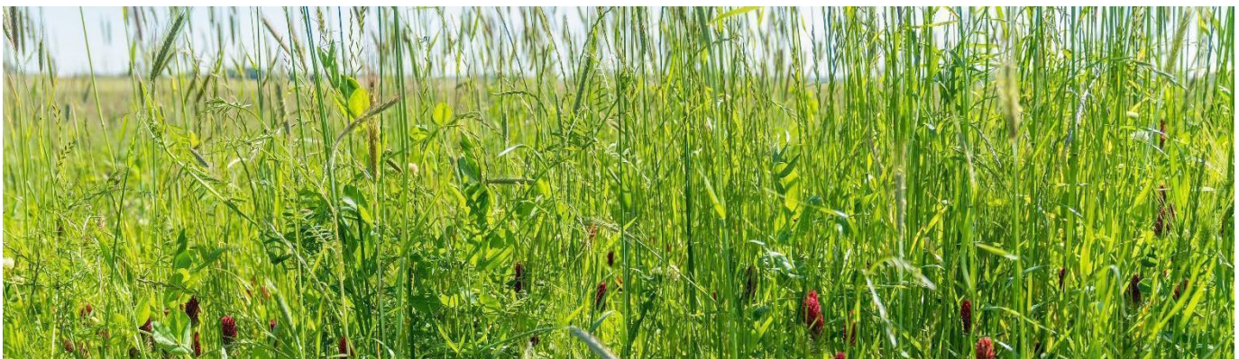
Image: Cover crops can reduce pest pressure, retain soil moisture, reduce soil temperatures, and mitigate nutrient loss.