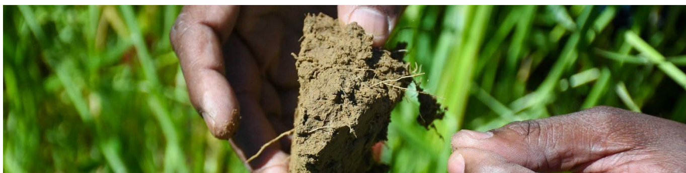
Image: Checking soil aggregate for organic matter and stability.