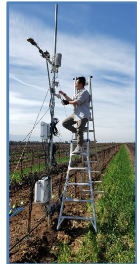
Instrumentation deployed in a vineyard for validation studies.

project team is working to quantify the potential co-benefits for management of nitrates and water quality in impacted watersheds. Based on past studies by CDWR, the project anticipates potential benefits to growers from $40 to $400 per acre resulting from improvements in water and fertilizer management.