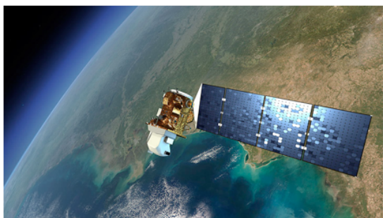
The Landsat 8 satellite

The NASA Satellite Irrigation Management Support (SIMS) system provides access to satellite-derived indicators of crop condition and daily crop evapotranspiration to growers and water managers in near real-time via web-based data services. The project builds upon commonly used methods for managing irrigation, and enhances information already used by growers from agricultural weather networks, such as