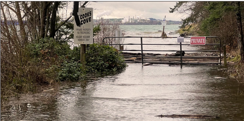
King tide flooding at Cooks Cove, Guemes Island, 2022.

the funded project will allow the Washington Department of Transportation to update its 2011 climate impacts vulnerability assessment. WSG will provide technical expertise in incorporating new data and tools, including up-to-date local sea level rise projections, into this assessment. WSG will also join the project team in working with local partners to identify three to six nature-based hazards resilience projects to implement at the community level. WSG will help to develop and implement community and stakeholder workshops toward this goal, as well as serve as a liaison between this project and other sea level rise and climate adaptation projects in Washington state.