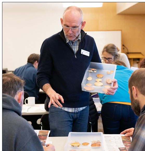
From top: part of Molt Search training is learning to properly measure molts across the widest part of the shell; Molt Search asks volunteers to collect any crustacean molts they find and trains them to distinguish European green crab molts from the molts of native crabs.