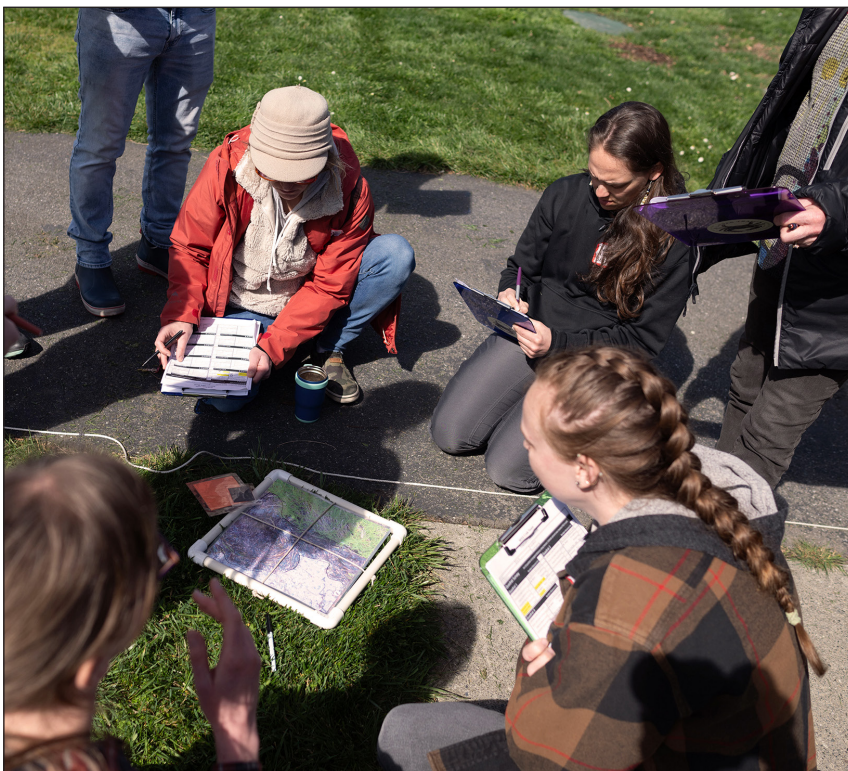
Volunteers learn Molt Search protocols at a training in Padilla Bay.

So how is it going so far? As of this writing, Molt Search had already recorded about 400 beach surveys input by more than 120 individual volunteers in different parts of Washington — sufficient, Watkins notes, to give WSG Crab Team and its partners “a really good dataset to work with.” As Crab Team focuses heavily on the early detection of green crab, this new, robust data is all the more important. Molts can serve as a window into all sorts of information about crab activity in an area. They indicate, first of all, that crabs are growing and therefore surviving well. They're also helping researchers learn more in real time about the connection between where molts are found and where crabs are actually living. Molt Search is even helping to build data about Dungeness crab,