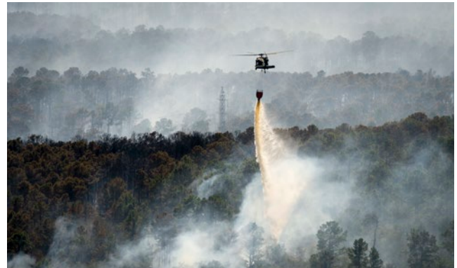
A Texas Army National Guard UH-60 Black Hawk helps fight wildfires.

The CPG addresses preparation and review of contingency and campaign plans, including homeland defense and military support to civil authorities. The 2021 CPG includes prioritization of severe weather challenges to war plan development, and future CPGs will include consideration of other aspects of climate change.