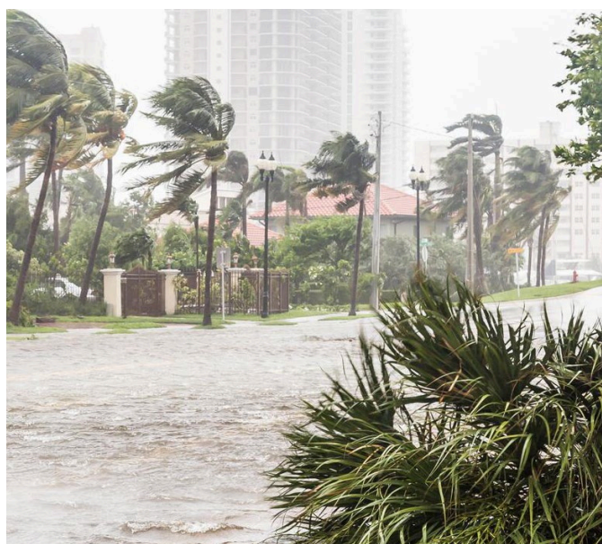
There is evidence that climate change is making hurricanes stronger and more destructive.

U.S. allies, partners, and competitors are assessing the implications of climate change on their respective strategic objectives. Malign actors may try to exploit regional instability exacerbated by the impacts of climate change to gain influence or for political or military advantage. Global efforts to address climate change – including actions to address the causes as well as the effects – will influence DoD strategic interests, relationships, and priorities. Cooperation with international partners to address the security implications of climate change can strengthen alliances and partnerships. Building awareness of how other nations are preparing for climate change is critical to understanding the risks and opportunities across strategic, operational, and tactical environments.