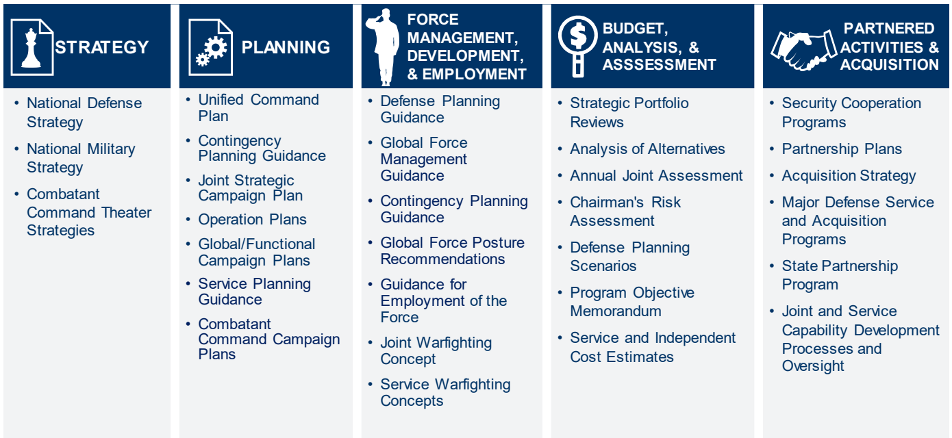
Figure 3. Examples of DoD documents in which climate will be incorporated.

Strategic documents signed by the Secretary or other senior DoD leaders guide DoD Components, formalize priorities to direct resource allocation, and drive action to accomplish desired ends. As required by EO 14008, Section 103(d), DoD will incorporate climate considerations into the National Defense Strategy (NDS); Defense Planning Guidance (DPG); the Chairman’s Risk Assessment; and other relevant strategy, planning, and programming documents and processes. A report on progress of this integration is due annually to the National Security Council starting in January 2022. Climate change will be integrated into several of these documents through the office of the Assistant Secretary of Defense for Strategy, Plans, and Capabilities under the USD(P). In addition to the guidance in EO 14008, Section 103(d), DoD will also include consideration of climate across all relevant strategy, planning, force management, force employment, force development, and budget documents as discussed below and summarized in Figure 3.