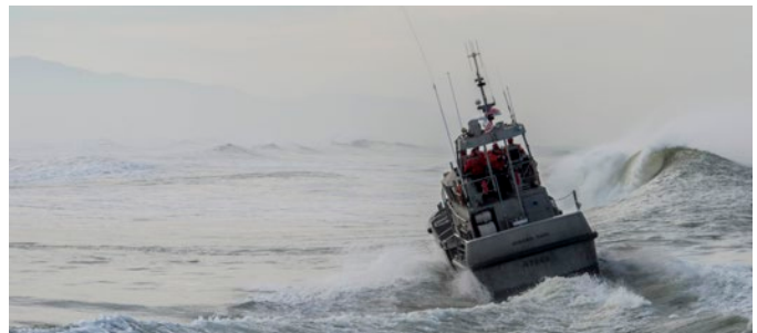
Coast Guard crews train in high surf to ensure they are prepared to respond to any maritime emergency during rough weather conditions.

scientific information at time scales required for DoD strategy and planning. DoD will validate its selection and use of climate data and projections internally and through consultation with scientific agencies and other partners such as DoD's Climate Working Group, DoD's Strategic Environmental Research and Development Program (SERDP), Federally Funded Research and Development Centers (FFRDCs), and the U.S. Global Change Research Program (USGCRP)—(of which DoD is a member)—within the White House Office of Science and Technology Policy (OSTP). DoD will continue to review and assess how to integrate climate science, data, and scenarios into Department documents and processes.