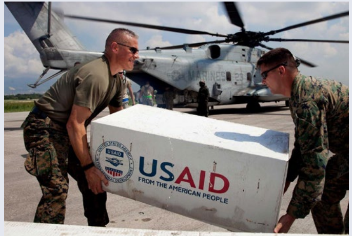
DoD supports the US Government Assistance to Haiti after Hurricane Matthew in 2016.