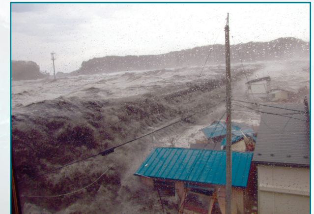
Tsunami striking Miyako City, Japan (2011).

For more information, visit www.weather.gov/tsunamisafety