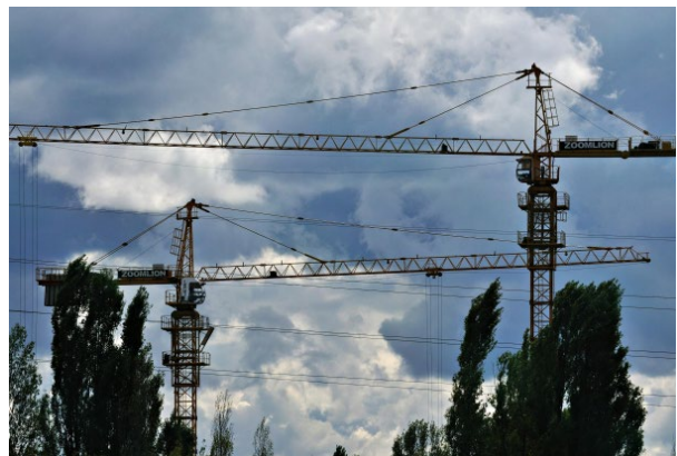
Figure 3: Cranes are especially vulnerable to lightning.

Employers should also post information about lightning safety at outdoor worksites. All employees should be trained on how to follow the EAP, including the lightning safety procedures.