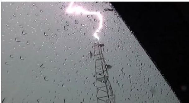
Figure 2: Lightning strikes a communications tower.

Check NOAA Weather Reports: Prior to beginning any outdoor work, employers and supervisors should check NOAA weather reports ( weather.gov ) and radio forecasts for all weather hazards. OSHA recommends that employers consider rescheduling jobs to avoid workers being caught outside in hazardous weather conditions. When working outdoors, supervisors and workers should continuously monitor weather conditions. Watch for darkening clouds and increasing wind speeds, which can indicate developing thunderstorms. Pay close attention to local television, radio, and Internet weather reports, forecasts, and emergency notifications regarding thunderstorm activity and severe weather.