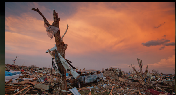
After a tornado, watch out for dangerous debris such as sharp metal, glass or downed power lines.

For more information, visit weather.gov/safety/tornado