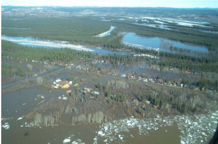
Photo 1: Koyukuk just before the runway was inundated, May 26, 2001 flood.