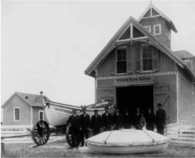
Surfmen with their lifeboat equipment in front of a U.S. Life Saving Station in North Carolina in the late 1800s. Records of the U.S. Coast Guard (RG 26) include records of predecessor agencies such as the U.S. Life-Saving Service. (26-CGS-66-02-01)

The records relating to enlisted crew members of the Revenue Cutter Service include muster rolls, payrolls, and shipping articles. In one series of muster rolls are unbound monthly reports, 1848–1910, arranged by name of vessel and thereunder chronologically. They are not indexed, so they can be searched only by name of vessel and the individual's approximate date of service. Muster rolls and payrolls show the name, and, when appropriate, signature or mark of each crew member. The muster rolls for the Revenue Cutter Service/Coast Guard, 1833–1932, provide name, rating, date and place of enlistment, place of birth, age, occupation, personal description, and number of days served during the reported month for each crew member, along with notes if the crewman was detached, transferred, discharged, deserted, or died during the report period. The records are arranged alphabetically by name of vessel.