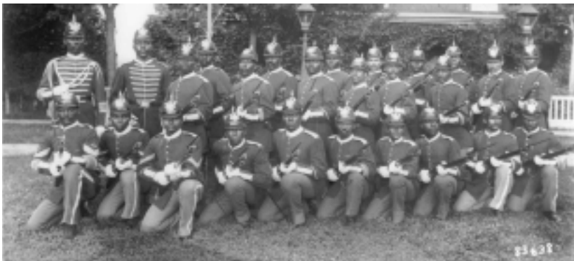
Soldiers of Company I, 25th U.S. Infantry, at Fort Snelling, Minnesota, taken in the 1880s. (111-SC-83638)

The place to start researching black regulars is Regular Army Enlistment Papers, 1798–1912, RG 94, entry 91. This series is arranged alphabetically by name of soldier and generally shows the soldier's name, place of enlistment, date of enlistment, by whom enlisted, age, place of