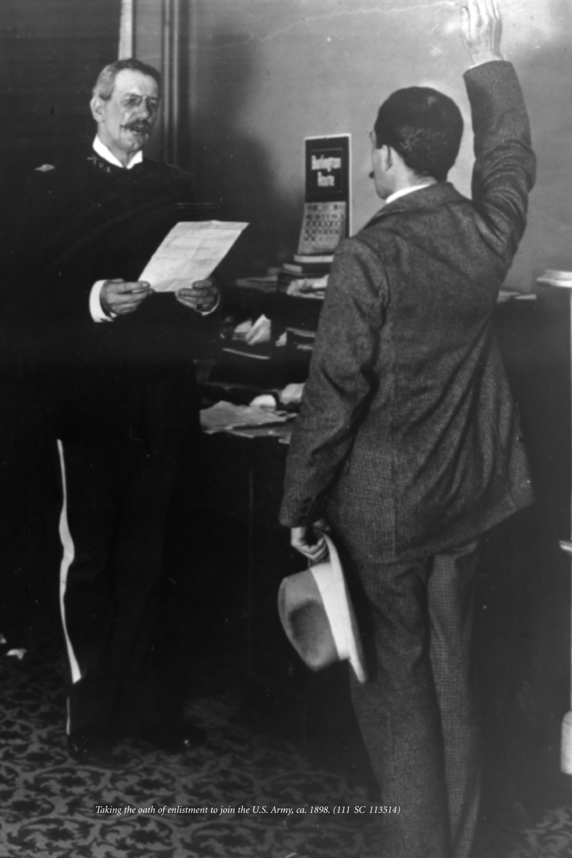
Taking the oath of enlistment to join the U.S. Army, ca. 1898. (111 SC 113514)