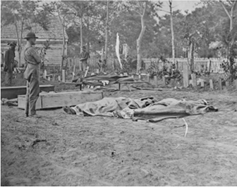
Burying the dead at Fredericksburg, Virginia. (111-B-71)

Another good series to consult is the Applications of Headstones in Private Cemeteries, 1909–1924, found in RG 92, entry 592. The headstone applications were often completed by superintendents of cemeteries and therefore do not contain next-of-kin information. Although the starting date of the series is 1909, many applications were submitted for veterans already buried in cemeteries prior to 1909. Like the card records of headstones, applications can also be found for veterans of earlier conflicts.