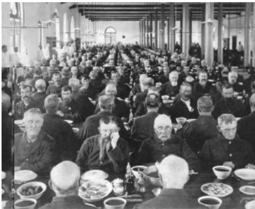
Veterans in the dining hall of the National Home for Disabled Volunteer Soldiers in Marion, Indiana, in the late 1890s.

The home registers have been reproduced as M1749, Historical Registers of National Homes for Disabled Volunteer Soldiers, 1866–1938 . This microfilm publication is available at the National Archives Building in Washington, DC, and many of the National Archives regional facilities. Some of the regional sites have all of the microfilm rolls covered under