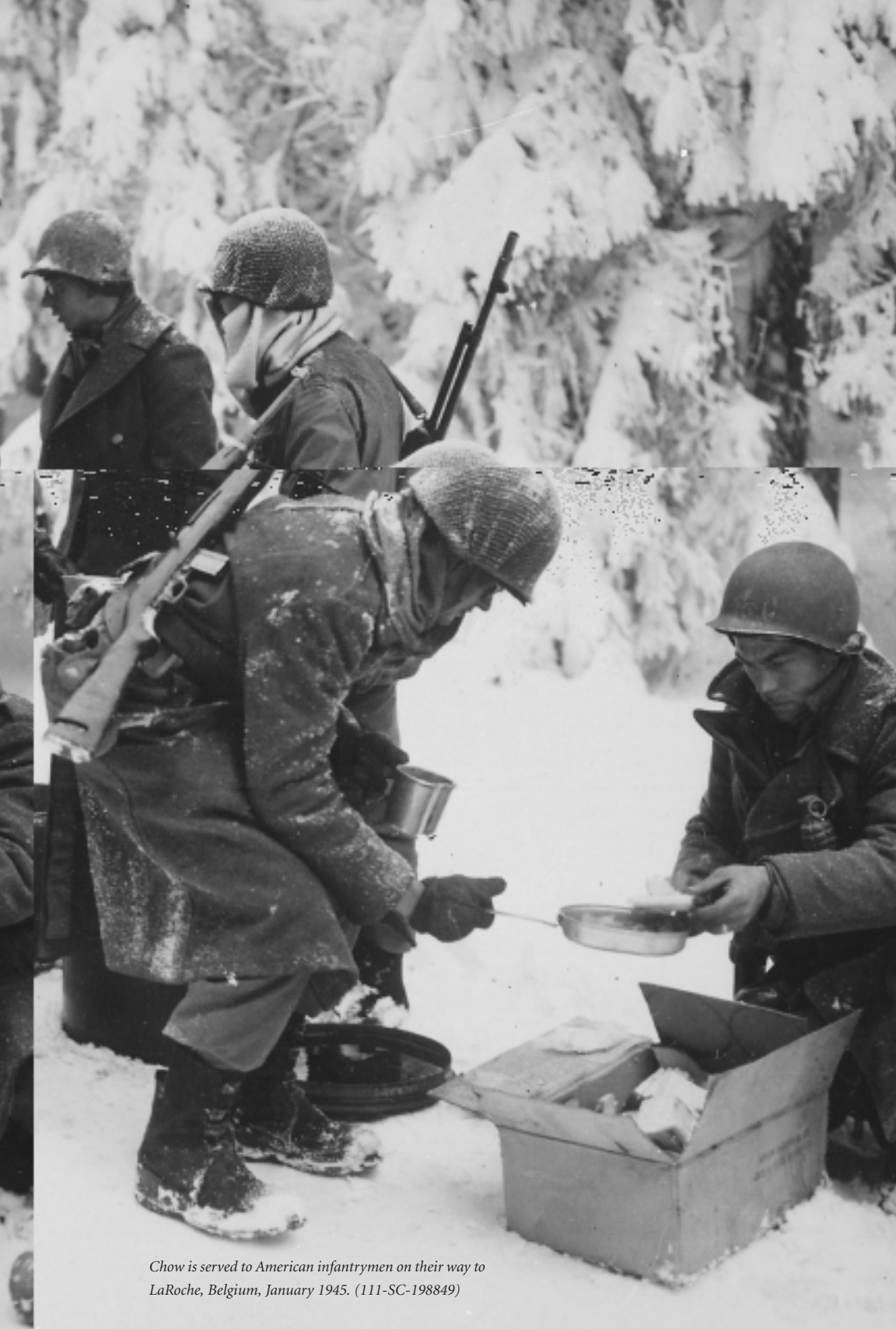
Chow is served to American infantrymen on their way to LaRoche, Belgium, January 1945.