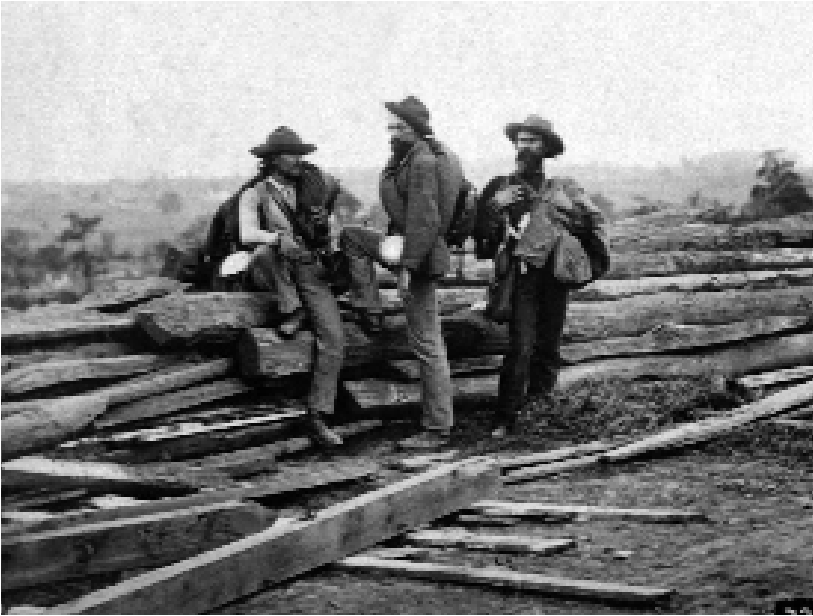
Confederate prisoners standing along a fence in Gettysburg, Pennsylvania. (200-CC-2288)

If you are researching a Confederate soldier, sailor, or marine who was captured during the war consult prisoner-of-war records found on M598, Selected Records of the War Department Relating to Confederate Prisoners of War, 1861–1865 . This microfilm publication contains lists and registers of prisoners of war and records related to individual prisons or stations. Records related to all prisoners include: registers of prisoners; registers of deaths of prisoners (compiled by the Office of the Commissary General of Prisoners); registers of prisoners' applications for release and decisions; registers related to release of prisoners; registers relating to prisoners' possessions; and registers of deaths of prisoners (compiled by the Surgeon General's Office). These records are followed by the records of individual prisons or stations including Alton, Illinois; Bowling Green, Virginia; Camp Butler, Illinois; Camp Chase, Ohio; Cincinnati, Ohio; Fort Columbus, New York; Department of the Cumberland; Fort Delaware, Delaware; Camp Douglas, Illinois; Elmira, New York; Gratiot and Myrtle Streets Prisons, St. Louis, Missouri; Department of the Gulf; Hart Island, New York; Hilton Head, South