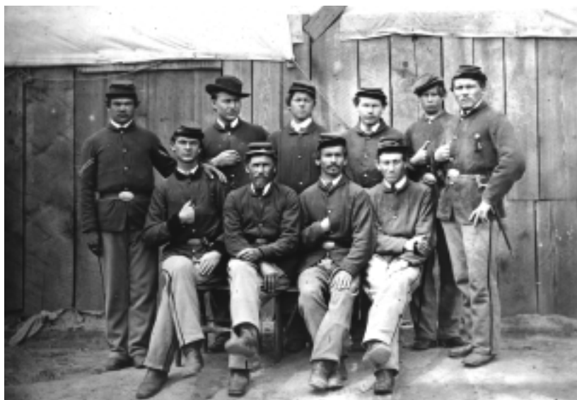
Union soldiers from the Army of the Cumberland awaiting court-martial. (111-B-2738)

Plante, Trevor K. "The Shady Side of the Family Tree: Civil War Union Court-Martial Case Files," Prologue , Winter 1998, Vol. 30, No. 4.