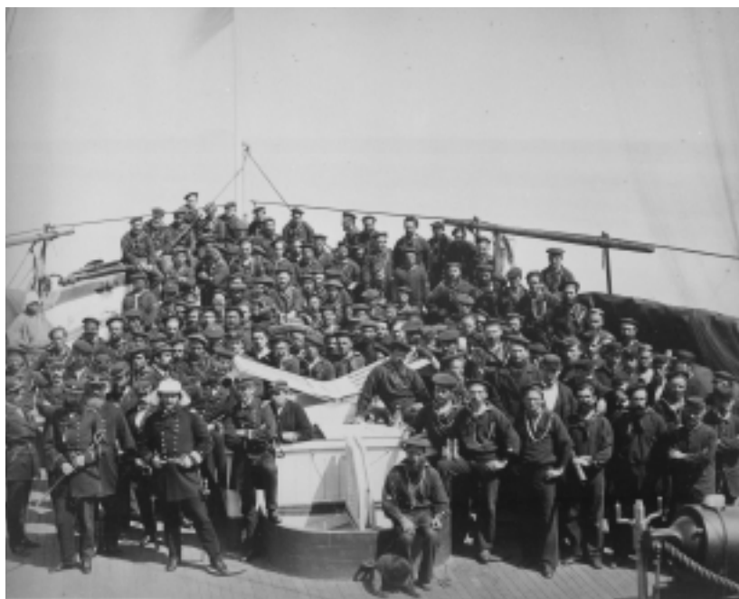
Officers and crew of the USS Monocacy, during the 1871 expedition to Korea.

class. Consulting the dictionary is important for several reasons. It is important to verify that the ship was in fact a U.S. Navy vessel and to verify dates of service. Before conducting a search in ship-related records make sure you have information on the correct vessel. Several ships served at different times under the same name, so first consult the Dictionary of American Naval Fighting Ships to find the dates of service of the vessel you are researching.