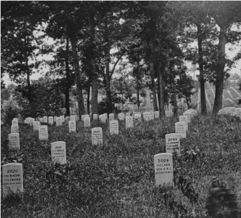
Civil War view of Arlington National Cemetery. (111-B-5304)

More than 40 years after the end of the Civil War, permanent, uniform markers were authorized for the graves of Confederate soldiers buried in national