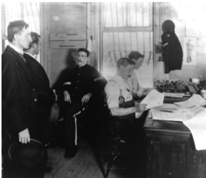
Recruits wait while clerks fill out Army enlistment papers, ca. 1898. These papers are found in entry 91, Enlistment Papers, RG 94, Records of the Adjutant General's Office. (111-SC-113512)

For medical information, consult carded medical records found in RG 94, entries 529 and 530 covering the years 1821–85 and 1894–1912 respectively. These cards relate to Regular Army personnel admitted to hospitals for treatment and may include information such as name, rank, organization, age, race, birthplace, date entered service, cause of