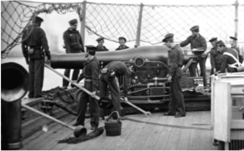
Crew working the gun on a Civil War Navy gunboat. (111-B-486)

ment data, and a summary of service. The series is arranged chronologically.