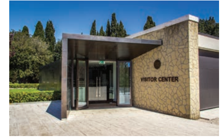
Entrance to the visitor center.

Dedicated in 2014, the 2,500 square-foot visitor center is adjacent to the visitor reception and family room located just to the right (North) of the cemetery entrance. The visitor center provides visitors the opportunity to meet members of the cemetery staff. They are happy to answer visitors’ questions and to provide information about the cemetery.