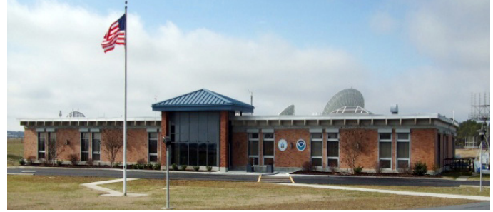
Wallops Command and Data Acquisition Station