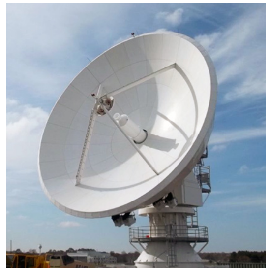
W-1 antenna at WCDAS

NOAA upgraded four 9.1 meter antennas at NSOF for compatibility with the GOES-R satellites and constructed three new 16.4 meter antennas at WCDAS and three new 16.4 meter antennas at CBU. The new and upgraded antennas maintain compatibility with the previous generation of GOES satellites, some of which remain on orbit as backup for NOAA's operational constellation. The antennas will operate continuously for the life of the GOES-R Series.