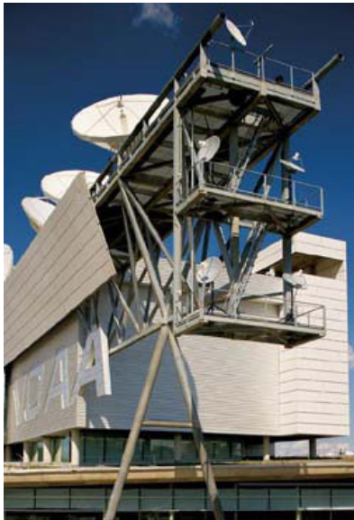
NOAA Satellite Operations Facility

Ground support is critical to the GOES-R mission. NOAA developed a state-of-the-art ground system that receives data from GOES-R Series spacecraft and generates real-time data products. This is accomplished via a core set of functional elements, which include space/ground communications, raw data processing, monitoring satellite health and safety, and commanding the spacecraft and instruments, as well as a new antenna system and a product access component.