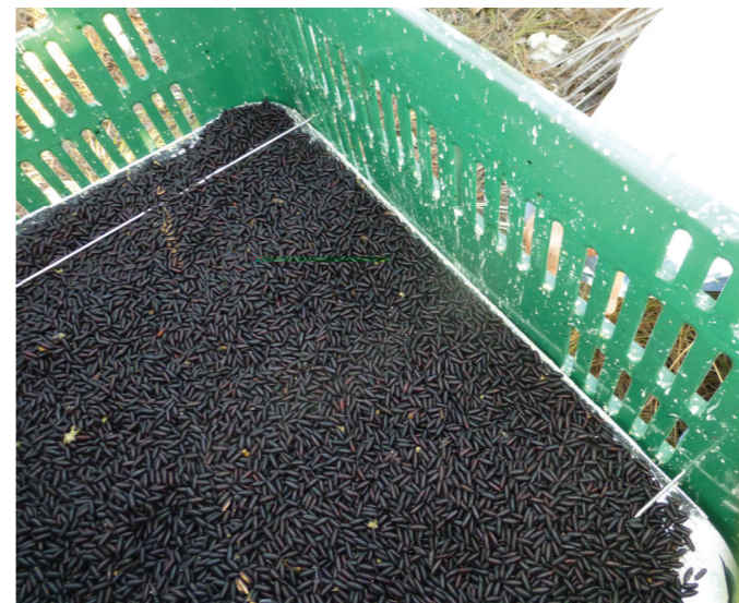
Sterilized NWS pupae released in infested area

Another incursion into the United States could cost millions of dollars from livestock losses, trade embargoes, and eradication work. Pets, livestock, wildlife, and even humans may suffer and die from screwworm myiasis.