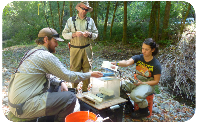
National Sea Grant Advisory Board June 2018