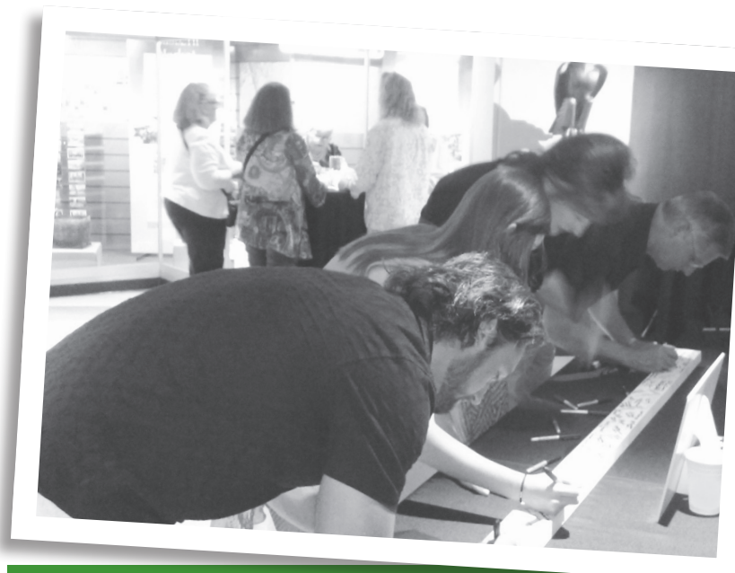
Members attending the Detroit Historical Museum's closure party in May had the opportunity to sign a 2 x 4 which has subsequently been placed into the infrastructure of the upcoming Gallery of Innovation exhibit on the second floor.