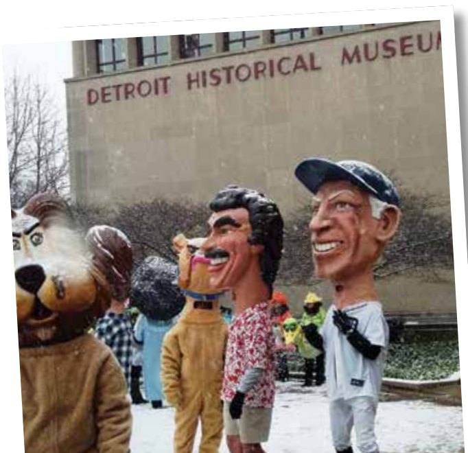
The "Big Head Corps" gathered on Legends Plaza to await their entry into America's Thanksgiving Parade. The Parade Company hosted breakfast for these volunteers that morning at the Detroit Historical Museum.