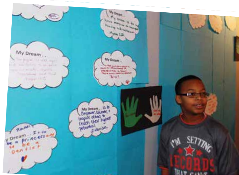
A child attending the Detroit Historical Museum's Martin Luther King Day holiday program places his artwork on the "dream board."