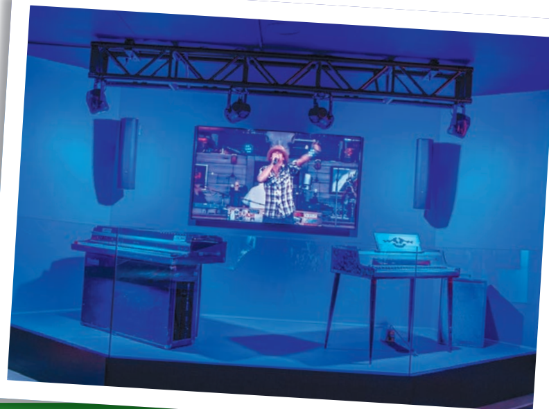
The Kid Rock Music Lab invites visitors to enjoy a concert, "mix" some music and learn how Detroit has created music heard around the world for more than 100 years.