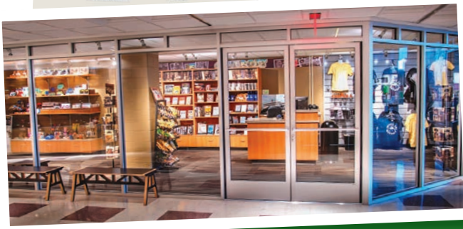
The new Detroit Historical Museum Store and website