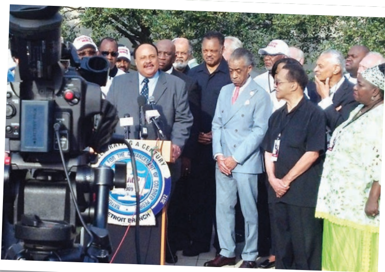
Martin Luther King, III addresses gathered media flanked by the Reverend Jesse Jackson, the Reverend Al Sharpton, and other leaders from the NAACP and the community as they kicked off the 50th anniversary of the 1963 Walk to Freedom on Legends Plaza at the Detroit Historical Museum.