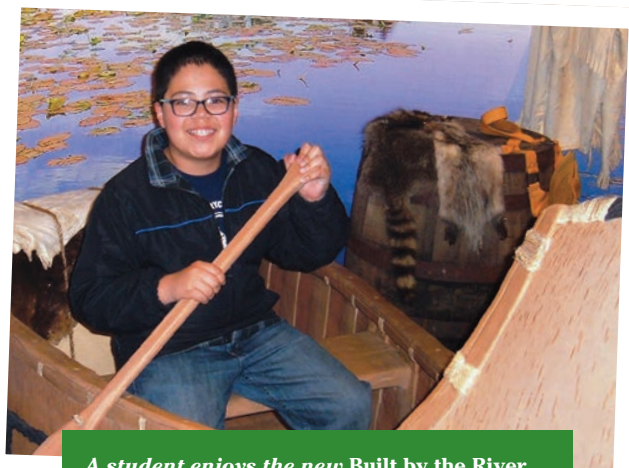
A student enjoys the new Built by the River exhibit at the Dossin.

program, we welcomed an additional 724 students to the Detroit Historical Museum; a 66 percent increase over the program's first year of operation. In all, 2,412 at-risk or underserved students visited the Museums free of charge during the year — 23 percent of all school field trip participants.