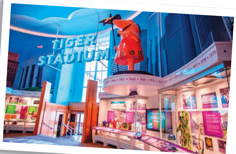
The new Allesee Gallery of Culture includes both the glowing neon letters from Tiger Stadium and a Little Caesars character weighing over 500 pounds.

Accident Fund AJAX Paving Industries, Inc. American Association of University Women Amerisure Insurance Companies Anthony M. Franco, Inc. AT&T Foundation Baker Group Baldwin Public Library Birmingham Unitarian Church Alliance Botsford General Hospital City of Huntington Woods Daughters of the American Revolution (Ezra Parker Chapter) Daughters of the American Revolution Louisa St. Clair Detroit Chamber Winds and Strings Detroit Windsor Tunnel LLC Dexter District Library East Detroit Retired Teachers Evangelical Homes of Michigan Friends of the Blair Memorial Library Friends of the Oak Park Library Friends of Wayne State University George Johnson & Company Goerlich Family Foundation Grosse Pointe Unitarian Church