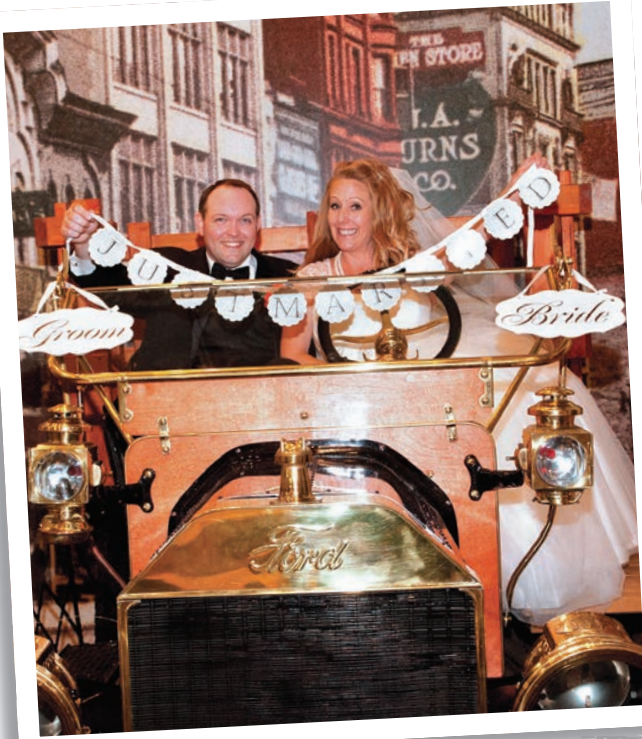
A happy couple celebrates their wedding in the America's Motor City exhibit.