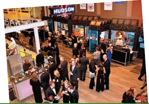
Detroit Historical Museum Grand Re-Opening Gala