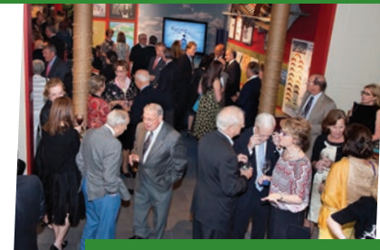
Dossin Grand Re-Opening Gala