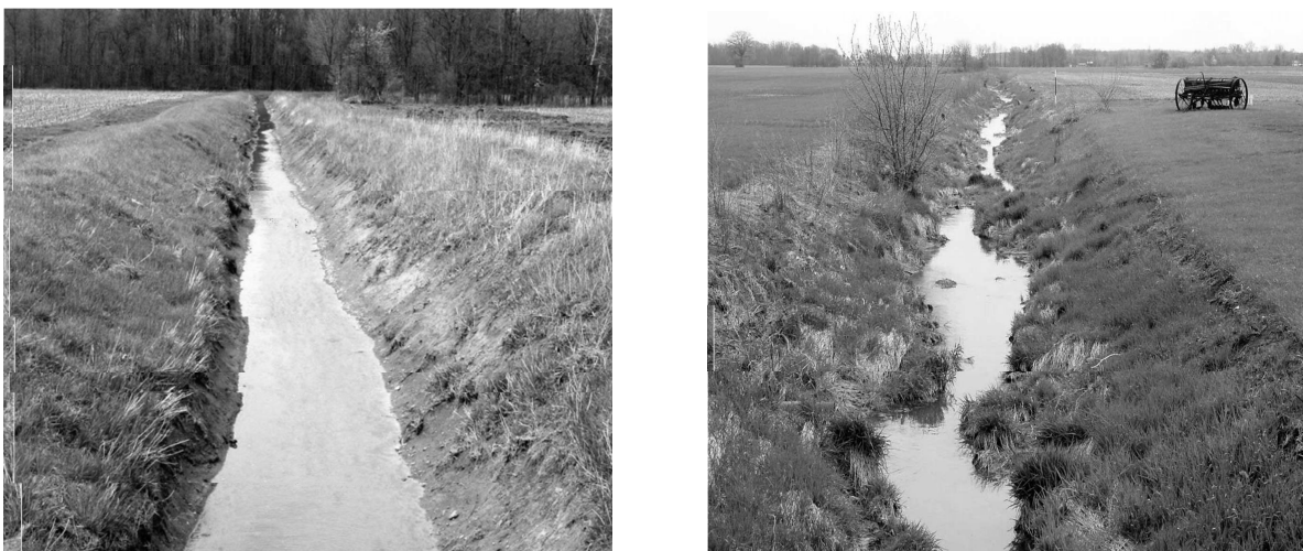
Figure 1: Boyd Feasel ditch, Seneca County (Ohio) in 2008. The left panel shows the ditch North of County Road 36 that was dredged in 2007. The right panel shows the same ditch, dredged pre-2002, South of CR36.

Unless disturbed by dredging, these ditches will respond over time by stabilizing their cross-sectional profile with sediment deposits and plant growth (Lyons et al. 2000, Rhoads et al. 2003) creating patches of narrower and deeper habitat that alternate with wider and shallower stream sections (Fig. 1). It is unclear if these changes actually inhibit the drainage properties of these ditches or if drainage capacity can be restored with means other than dredging down to the conventional trapezoidal cross-section (Fig. 1, left panel). Advances in soil conservation, perhaps coupled with a reduced need for dredging, have contributed to research and applications for managing these systems both as stream habitat and drainage ditches using compound channels with sediment deposits and plant growth (Landwehr and Rhoads 2003, Ward and Trimble 2004, Boody et al. 2005).