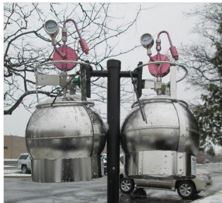
Canisters sampling air for ethylene oxide

EPA scientists are working to improve the current measurement method, which is known as “TO-15A.” TO-15A is commonly used to measure air toxics, including ethylene oxide. Air samples are collected in a canister over a 12- or 24-hour period, then sent to a laboratory for analysis. EPA is working to improve this method and to develop new technologies and methods that would allow us to measure ethylene oxide at lower levels than is currently possible, and in near-real time. EPA also is working to improve our understanding of how ethylene oxide interacts with other pollutants in the atmosphere