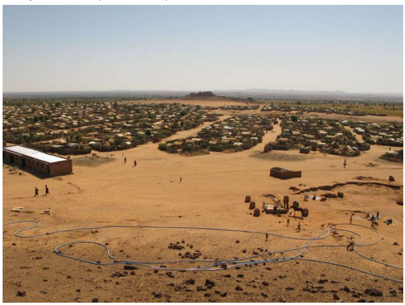
View of the Farchana Camp from a nearby hill.

A team comprised of three physicians (an internist, a urogynecologist, and a psychiatrist) and a human rights researcher used quantitative and qualitative data from a non-probability sample of 88 women refugees in the Farchana Camp. The field investigation consisted of a questionnaire with 42 questions about the respondent's life in Darfur, the events that caused her to leave Darfur, her life in Chad and her self-reported health status. Clinicians also conducted physical and psychological evaluations of 21 of the women who had reported physical or sexual assault. These evaluations were based on the Manual on Effective Investigation and Documentation of Torture and Other Cruel, Inhuman or Degrading Treatment or Punishment