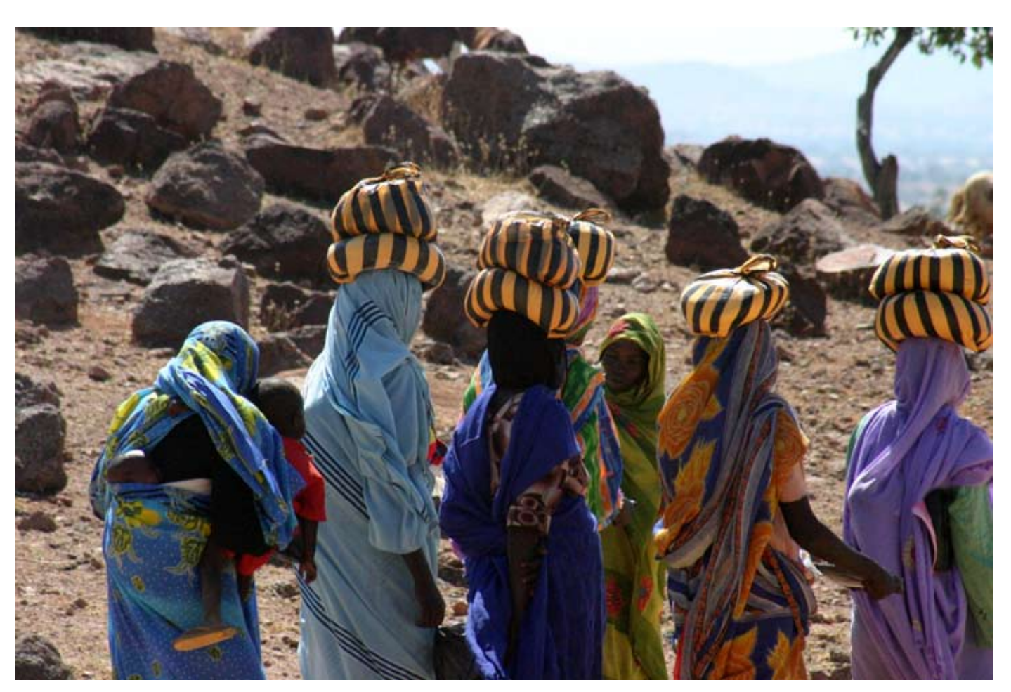
Women returning from the market in Farchana village.

"During the attack I was shot. I had my grandson on my back. I was shot twice by the Janjaweed and fell to the ground. My daughter grabbed her son and ran. The