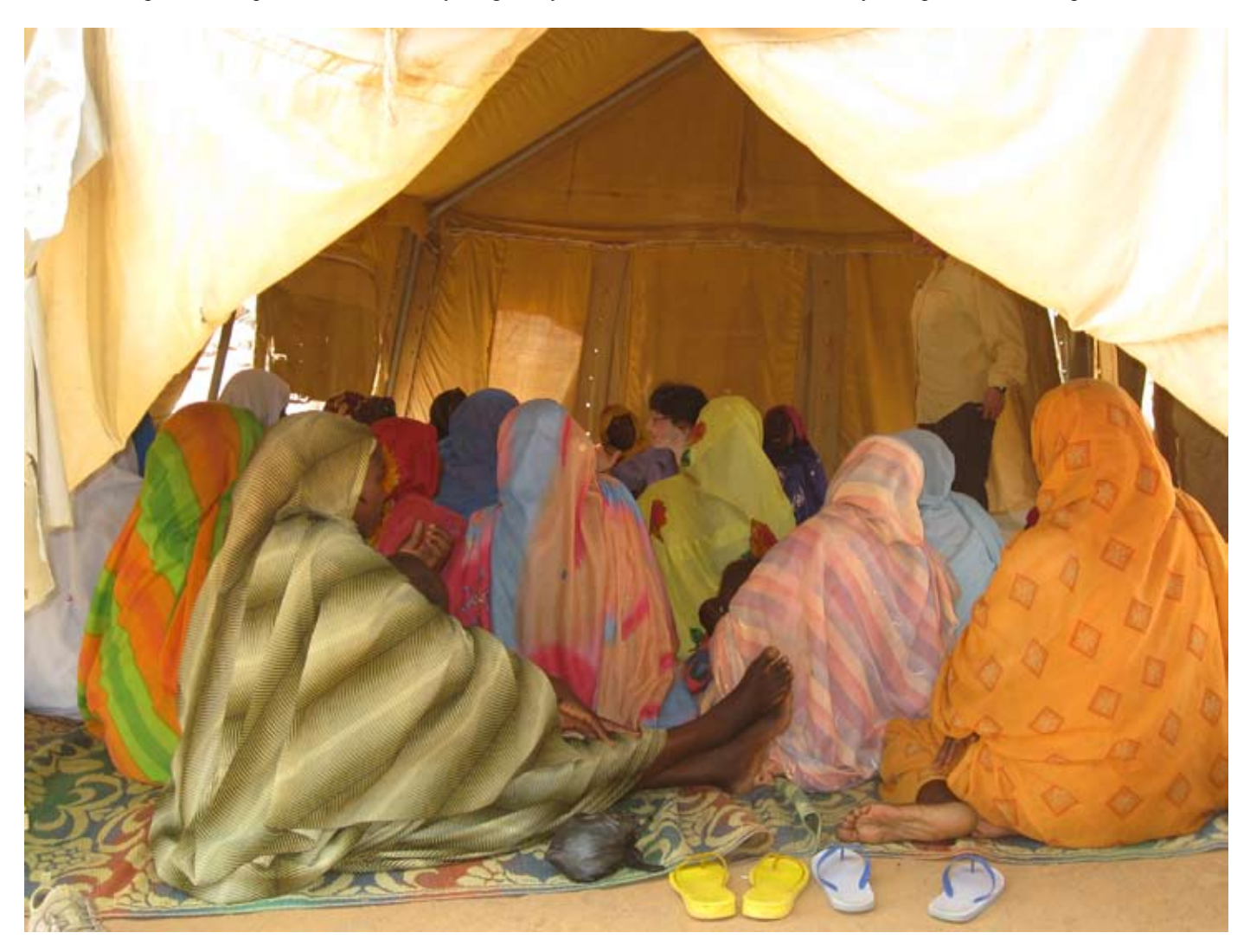
Sheikhas (female leaders) listen to PHR/HHI researchers explaining the project.

The interviews were conducted in the private courtyard of a gated distribution center. Passersby were at least 25 feet away from where the interviews were held and the respondents were seated with their backs to the outside so their faces could not be seen and the interviews could not be overheard. Interviews were conducted through four interpreters hired and trained for two full days by PHR/HHI. All spoke Arabic and English. All four lived in Chad; one was Chadian (and had previously worked in two of the refugee camps), two were Darfuri and one was from Kordofan (to the east of Darfur). When respondents spoke limited Arabic, a secondary interpreter of the respondent's choice,