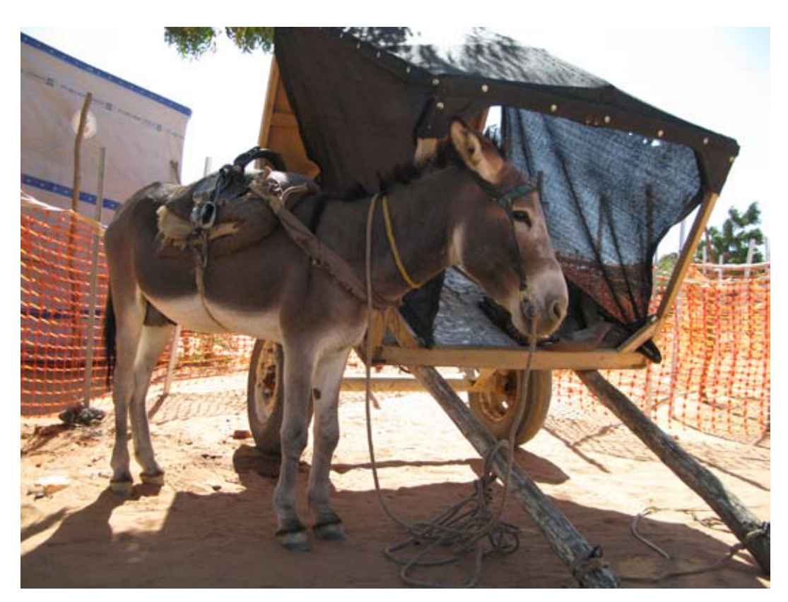
Very sick patients are brought to the clinic on this 'ambulance'.

Women who did report the crimes were turned away. "We told the police about what happened to us. They said, 'We can't do anything against the plane [that dropped bombs] or what the government is doing. The only thing you can do is go to Chad. There's no place for you here."