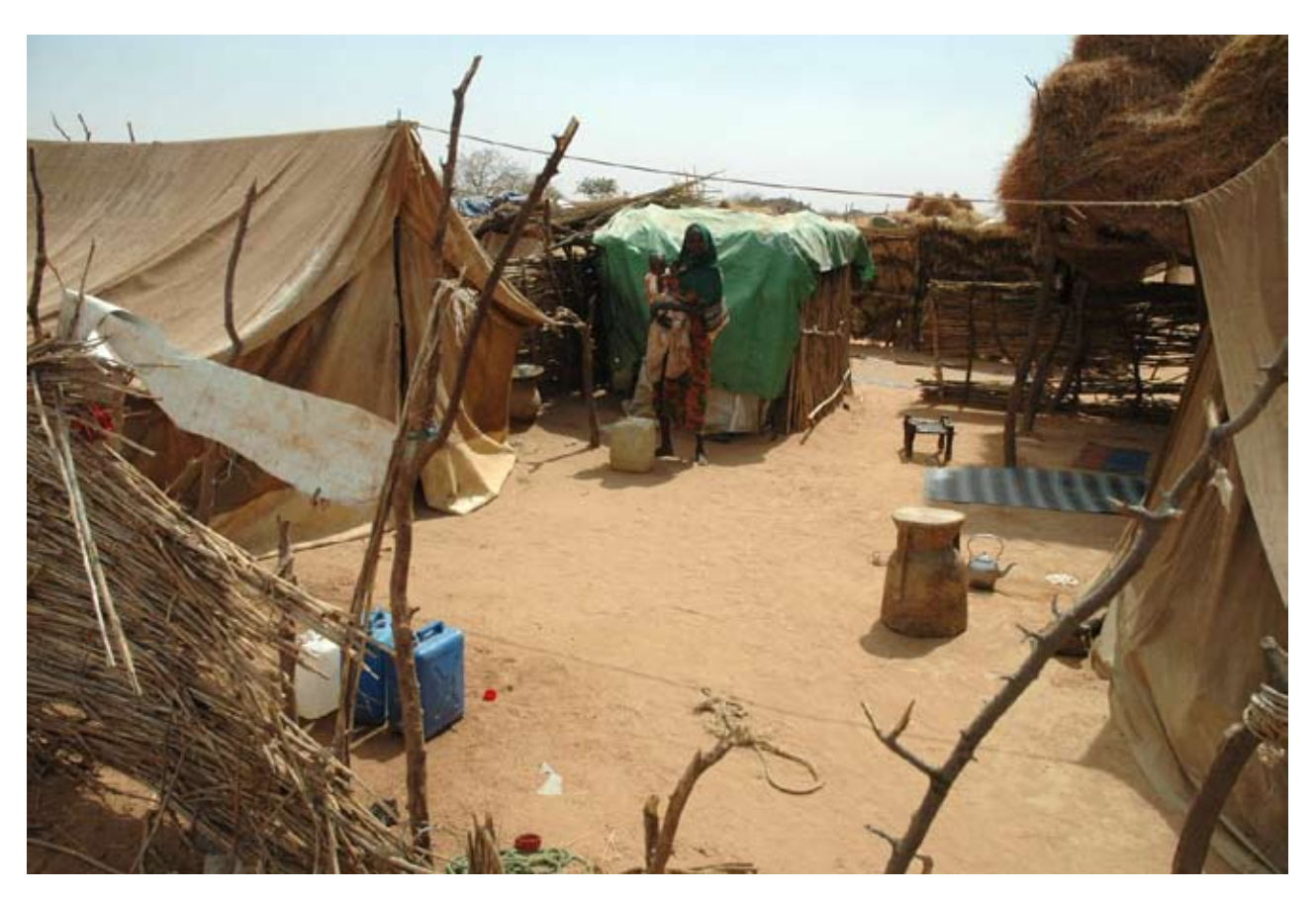
Tents in the living area of compound. (Michael Wadleigh)