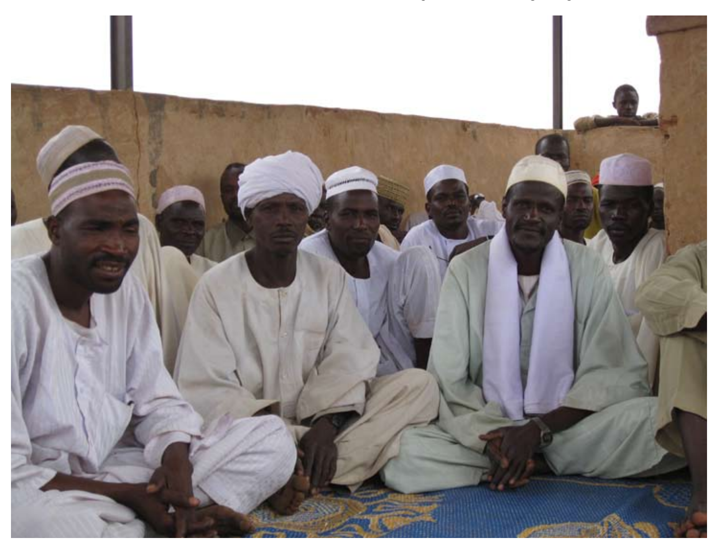
The Sheiks (male leaders) of Farchana Camp gather to hear PHR investigators explain the project. (Karen Hirschfeld)

Of the 32 instances of confirmed and highly probable rape, 15 occurred in Chad, with one woman assaulted twice there. Of these, eleven were confirmed rapes and four were highly probable rapes. Of the eleven confirmed rapes, eight were reported to have resulted in a pregnancy. There was one confirmed gang rape. The majority of confirmed rapes (10/11) occurred when women left the camps in search of firewood or to pasture their livestock. Respondents identified the rapists as Chadian soldiers and civilians. While NGOs acknowledge that rape and sexual assault of refugee women in camps is occurring, it is likely that the extent of the problem is substantially underreported due to stigma and repercussions following divulgence of a sexual assault.