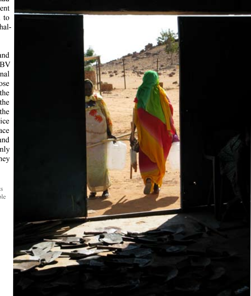
Woman leaving distribution center.

123 Prosecuting sexual violence that occurred in Darfur under the Rome Statute presents major challenges in terms of investigation. The ad hoc criminal tribunals for Yugoslavia and Rwanda (the ICTY and the ICTR, respectively) both had difficulty collecting evidence in a safe and effective manner. The International Criminal Court, like the ICTY and the ICTR, has faced great obstacles gathering evidence of the perpetration of rape as a weapon of war. These obstacles have included limited access to the affected populations, and difficulty building trust with the survivors, and challenges to ensuring the security and confidentiality of investigations. Regardless of the challenges, based on its long experience documenting sexual violence by speaking with survivors, PHR-HHI believes it vital for the Prosecutor to continue to investigate and pursue allegations of rape and other sexual violence.