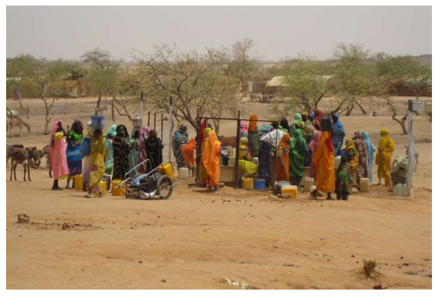
Women wait for water. (Karen Hirschfeld, PHR)