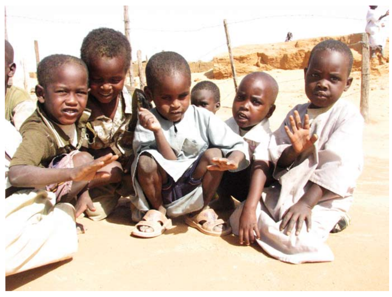
These children have grown up in the camp. (Karen Hirschfeld)