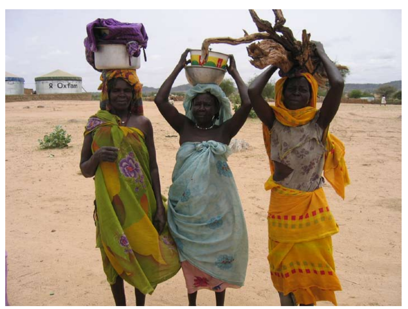
Women carry home firewood and water.

Women in this sample reported that the ever-present threat of rape was a constant source of fear but it was augmented by an omnipresent sense of latent gender-based violence and abuse. Unaccompanied women felt at greatest risk in general, but certain necessary behaviors (foraging for firewood) placed all women in known jeopardy. The field team heard reports of women who had been physically or verbally abused by