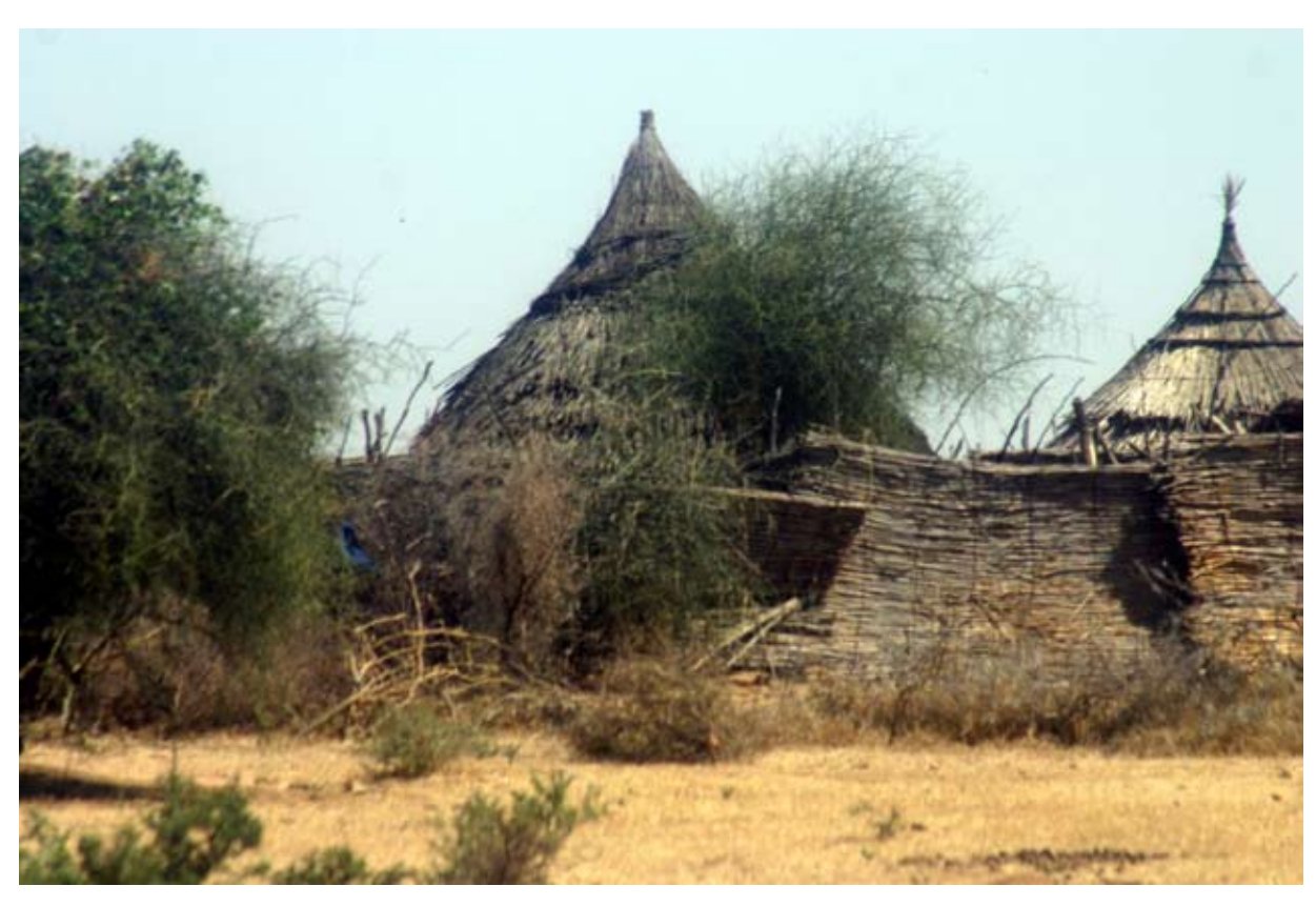
Some huts in eastern Chad. The country's east is extremely poor and environmentally fragile, and the presence of the refugees exacerbates tensions. (Dr. Lin Piwowarczyk)