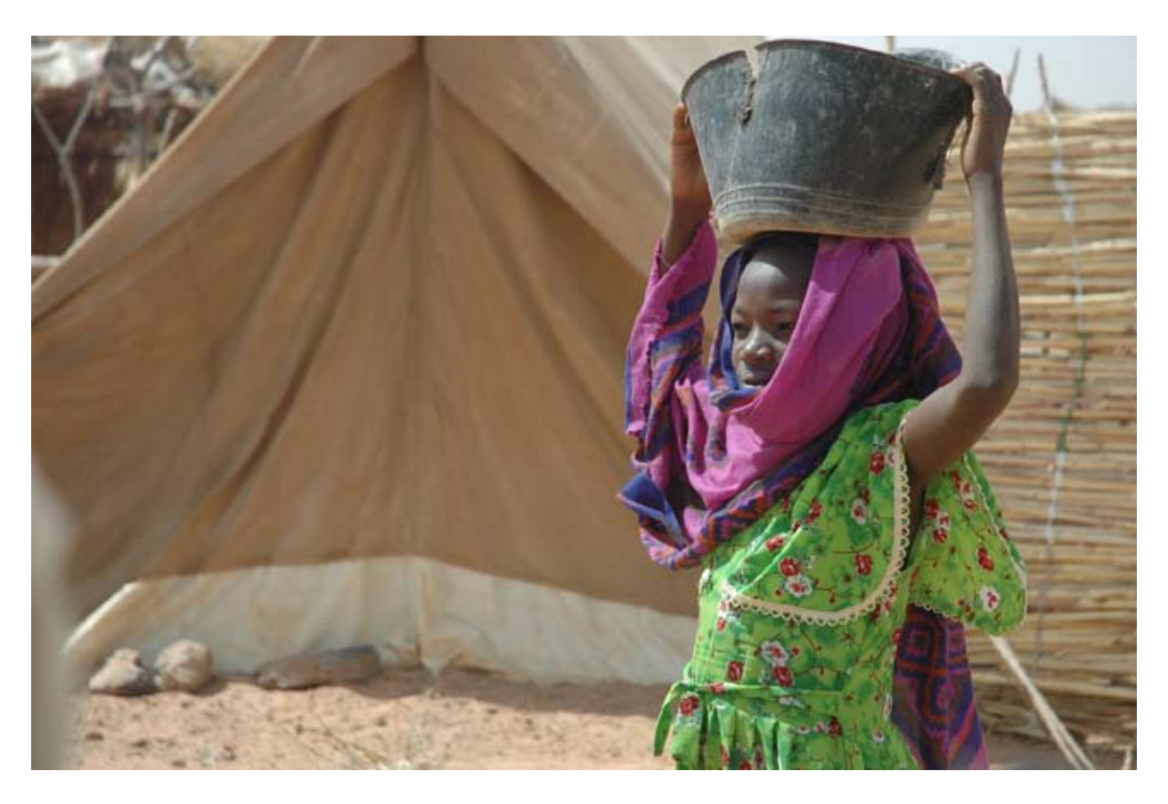
A girl carries water back to her tent.

"I feel ashamed – I don't want to tell anyone what happened to me."