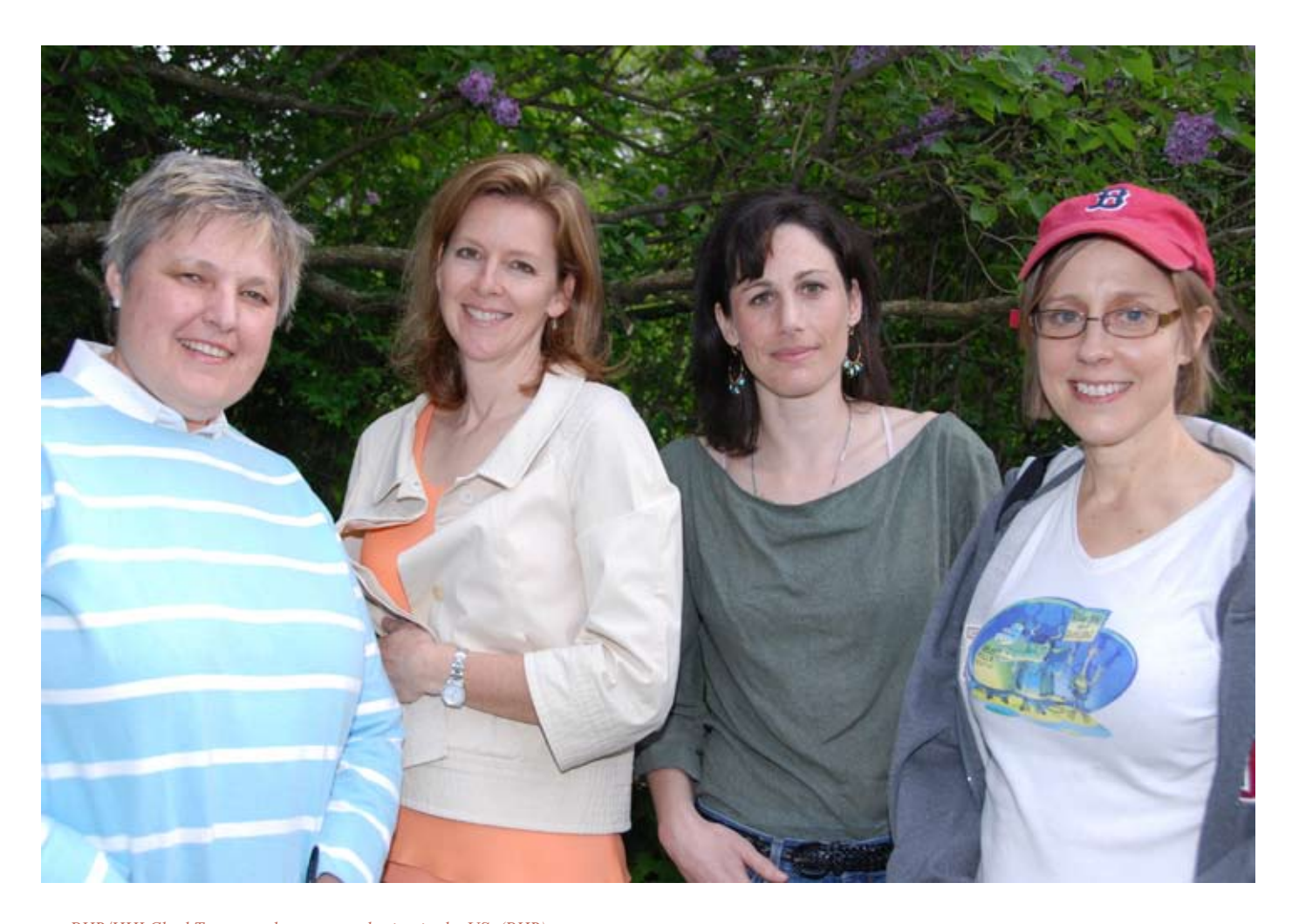
PHR/HHI Chad Team members at a gathering in the US.

crops, entire villages and sometimes burning of human bodies. The attackers specifically targeted men for death and women for rape: the women reported that men were shot, stabbed and killed more frequently than women, especially when the men tried to intervene and/or protect women during these attacks.