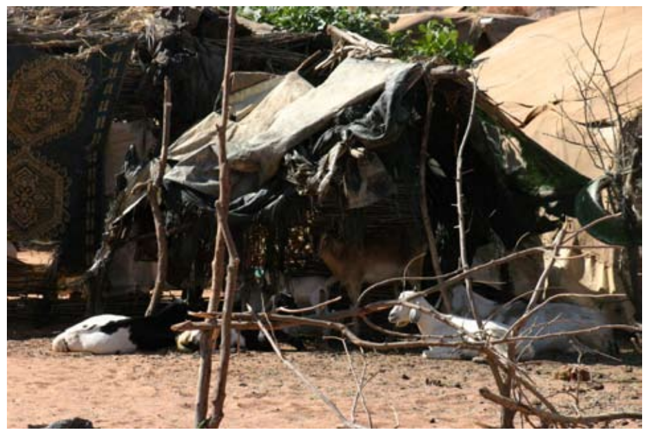
A dwelling in the camp.