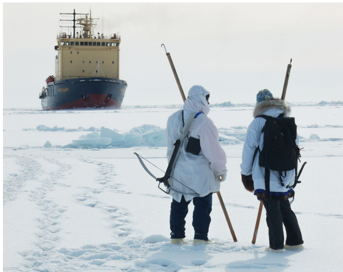
Arctic Native ice testing stick.

Additional funding opportunities to support the co-production of knowledge and include Indigenous people and organizations in Arctic research can be found on NSF's Office of Polar Programs page.