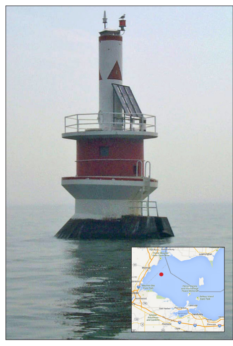
Toledo meteorological station located at the end of the Toledo shipping channel in the western basin of Lake Erie.