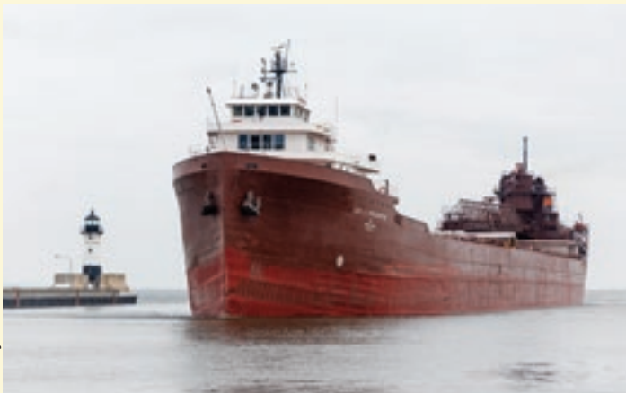
Lee A. Tregurtha arrives to winter over in the Twin Ports.