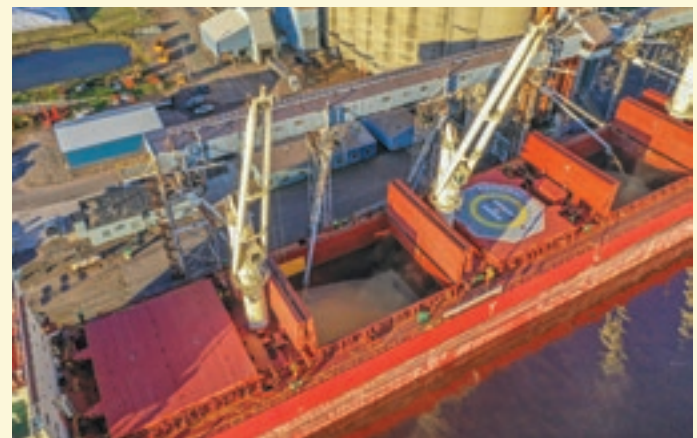
Federal Bristol loaded soybeans at Gavilon— first time in 11 years.