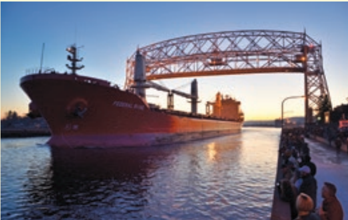
Federal Rhine was the last saltie to load and leave in 2018.