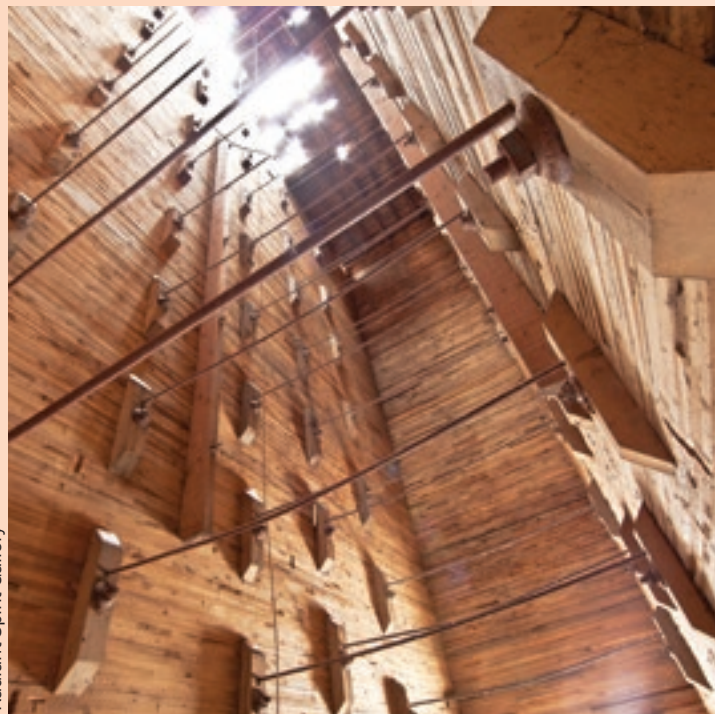
Radiant Spirit Gallery

The beauty and character of the old-growth wood used to build the Globe Elevators was captured during a 2013 photo shoot. Sections of wood had been eroded by grains cascading over them for decades; the patterns were mesmerizing. This angled view looks skyward from inside a bin with sunlight pouring through roof openings.