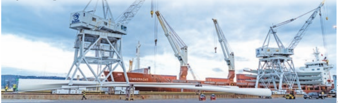
Duluth Cargo Connect handled domestically produced windblades for export to Europa in November.