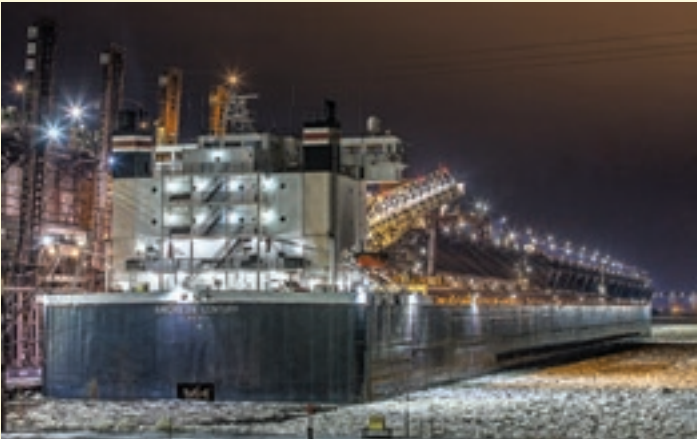
American Century was the last outbound laker of the season.