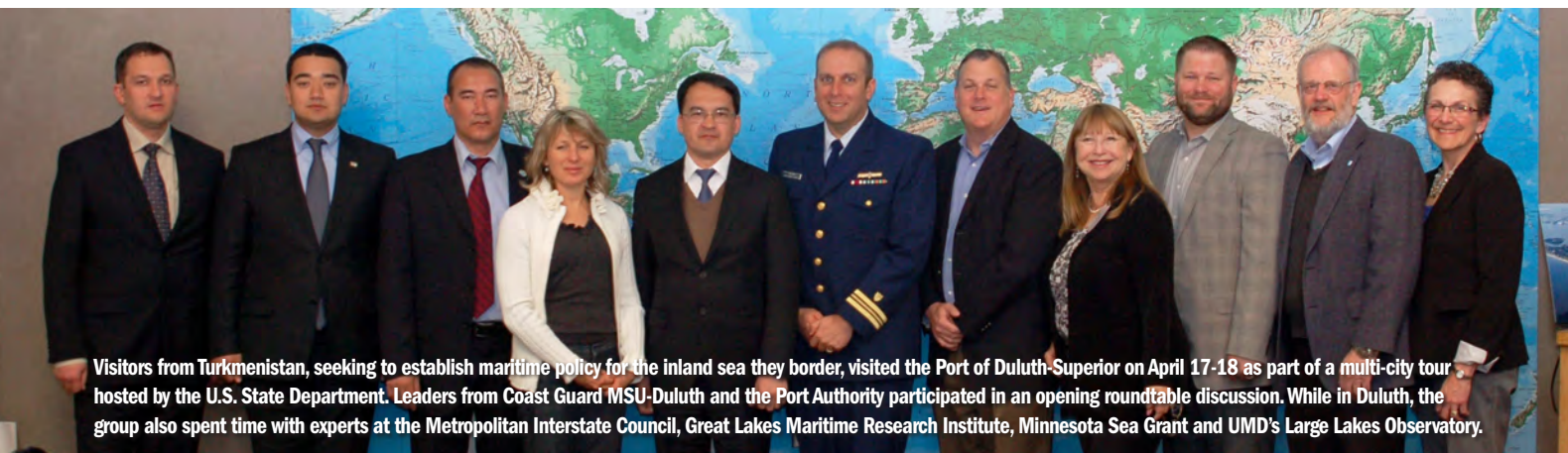
Visitors from Turkmenistan, seeking to establish maritime policy for the inland sea they border, visited the Port of Duluth-Superior on April 17-18 as part of a multi-city tour hosted by the U.S. State Department. Leaders from Coast Guard MSU-Duluth and the Port Authority participated in an opening roundtable discussion. While in Duluth, the group also spent time with experts at the Metropolitan Interstate Council, Great Lakes Maritime Research Institute, Minnesota Sea Grant and UMD's Large Lakes Observatory.