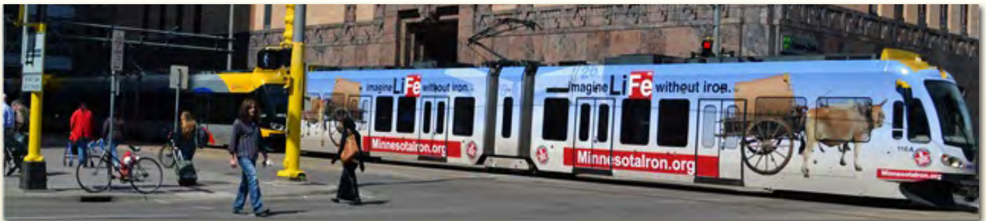
This light rail tram in the Twin Cities reminds people that life without iron is unimaginable.