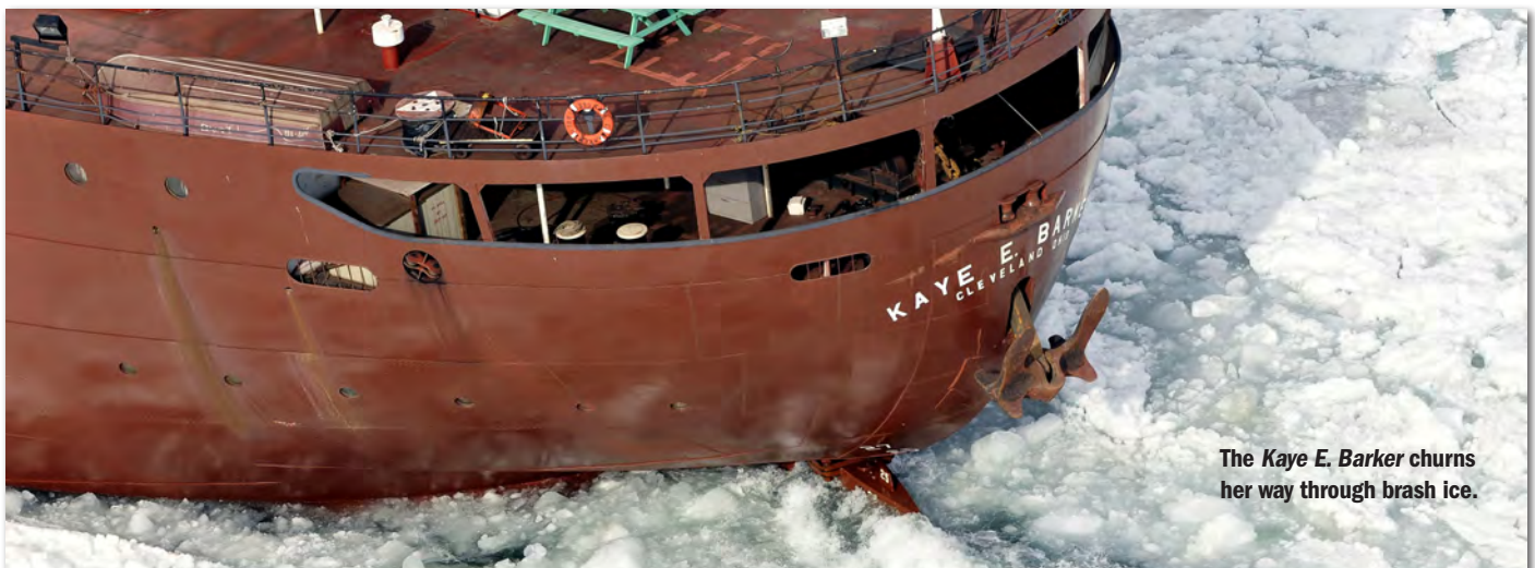
The Kaye E. Barker churns her way through brash ice.

Ships sometimes become beset in ice so thick that the vessel is stopped in its track and unable to proceed on its own. When a ship hoves to , it means that the captain has voluntarily stopped in the ice to wait, perhaps for daylight, for the rest of a convoy to catch up or an icebreaker to arrive before proceeding.