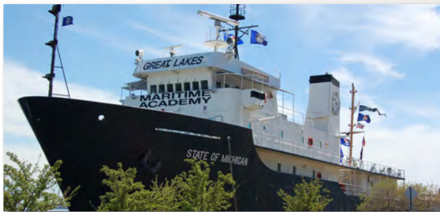
All GLMA cadets spend their first sea project on the training vessel State of Michigan .

limited tonnage ocean license and Great Lakes pilotage. The academy — a public college and not a military institution — admits about 60 cadets into its licens-