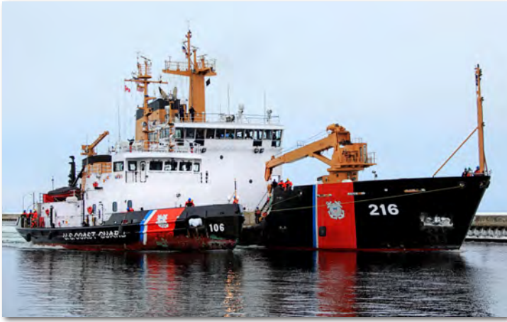
It isn't often that we see a disabled U.S. Coast Guard cutter, but here is the Morro Bay (106) being escorted into Port by the cutter Alder . In the photo at right, a diver is on his way below to determine the extent of the Morro Bay's rudder damage.