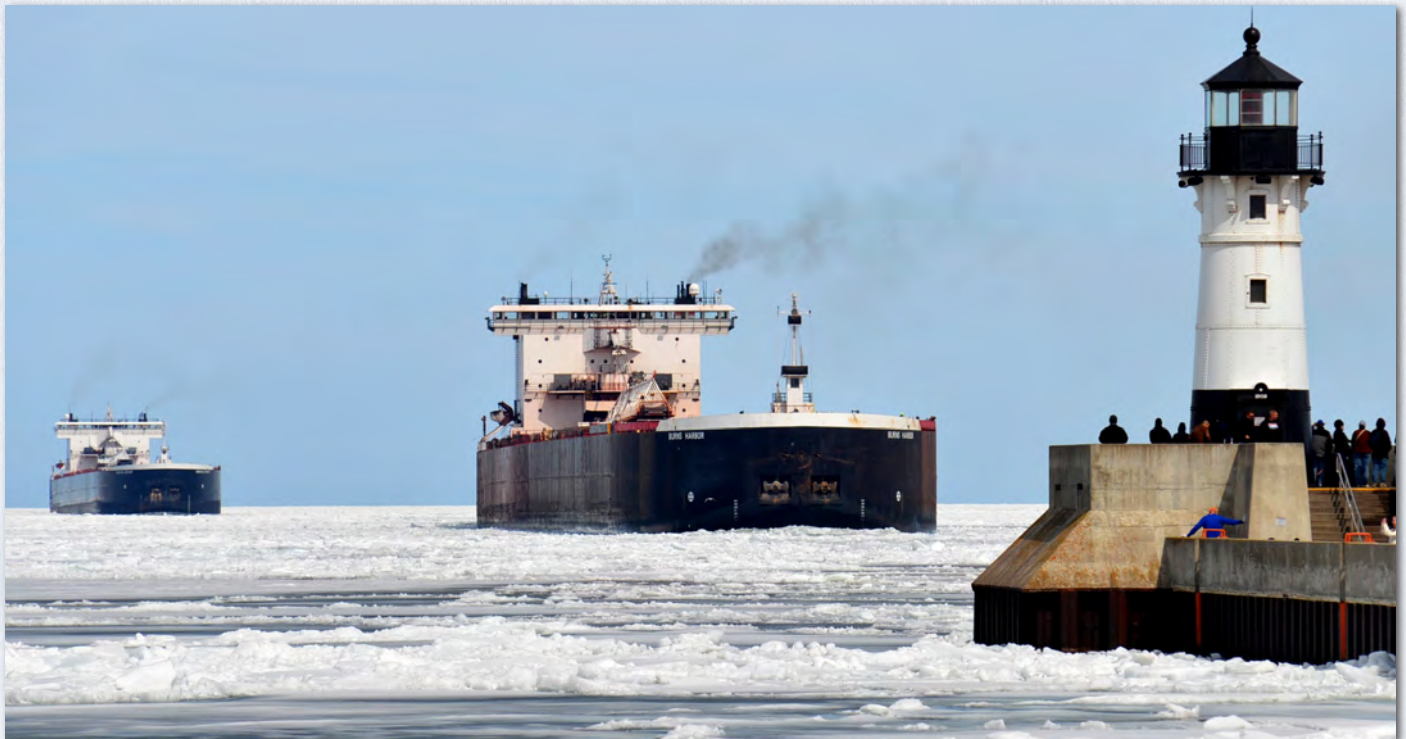
The Burns Harbor leads the American Century into Port on April 26 as convoys escorted by icebreakers battle their way from the Soo to Duluth-Superior.

But the industries that depend on the timely movement of vital cargoes could not wait. Stockpiles of iron ore and coal were running seriously low. Waiting for Mother Nature to melt the ice was not an option.