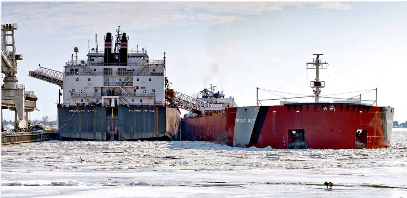
The Presque Isle , having sustained hull damage during her first attempt to start the season, transfers some cargo onto the American Spirit before tying up for repairs.

But conditions would improve. By the third week of April, ice was deteriorating in many parts of the waterway, though ships slogging across Lake Superior were still encountering ice two and three feet thick, plus walls 12 to 14 feet high that had been created by winds and waves.