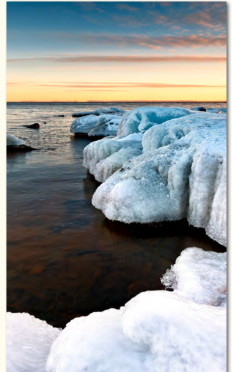
Lake Superior ice, one last look.