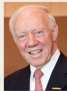
Jim Oberstar: maritime advocate and champion for northern Minnesota.

On May 8, the day of his funeral, U.S.-flag vessels working the Great Lakes lowered their flags to half mast in his honor. Interlake Steamship Company's Hon. James L. Oberstar , as she approached the Aerial Lift Bridge that morning, sounded two long and three short blasts — the formal Interlake Fleet whistle salute to the ship's namesake.