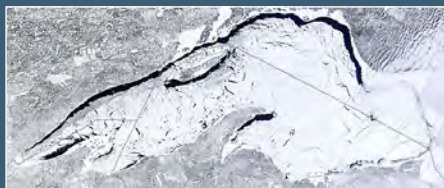
Lake Superior ice cover, April 14, 2014.